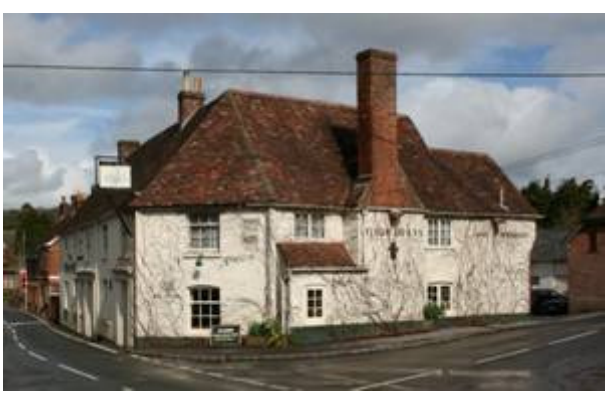
Figure 12: View of the Fleur-de-Lys Inn.

In 1755-6, the Blandford to Salisbury Road was turnpiked. This new road passed about 5 km to the northwest, bypassing the town. This may have lead to the decline of Cranborne in the 19<sup>th</sup> century (Hawkins 1983, 11). The road from Cranborne to Wimborne, Wimborne Street, was also turnpiked, but the road north along Salisbury Street was not, which left Cranborne without a good quality through road.