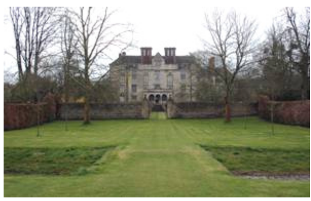
Figure 15: View of the north front and gardens of Cranborne Manor.