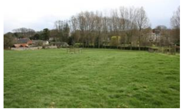
Figure 9: View of The Close, north of Cranborne Manor, looking south.

The medieval market lay at the junction of High Street with Salisbury Street/Wimborne Street. High Street also represented an east-west through route along the Crane valley during the medieval period (Good 1966). Back lanes are likely to have marked the rear of the High Street plots, as well as providing access along the valley in times of flood. These may be represented by the modern Church Street, Castle Street (formerly Dry Street) and Grugs Lane.