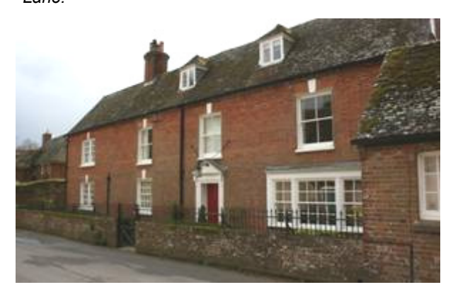
Figure 18: Red Lion House, 35 Salisbury Street.