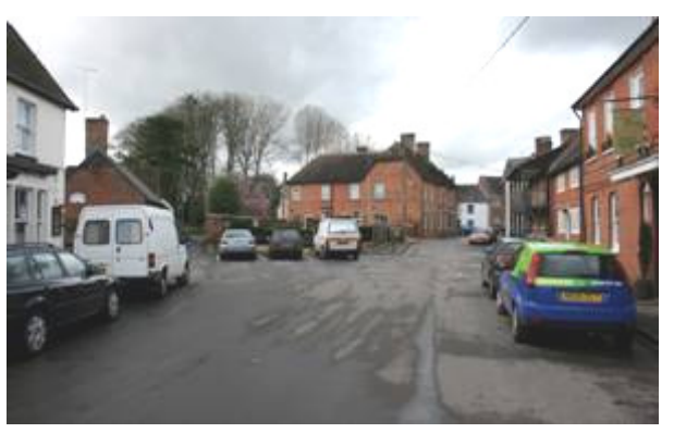
Figure 11: View of the market place from the east.