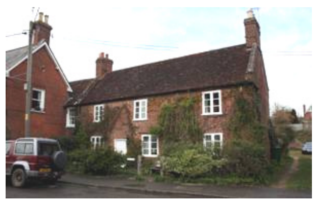
Figure 16: View of The Web, 10-11 The Square .