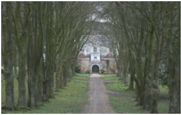
Figure 7: View of the south front of Cranborne Manor House.