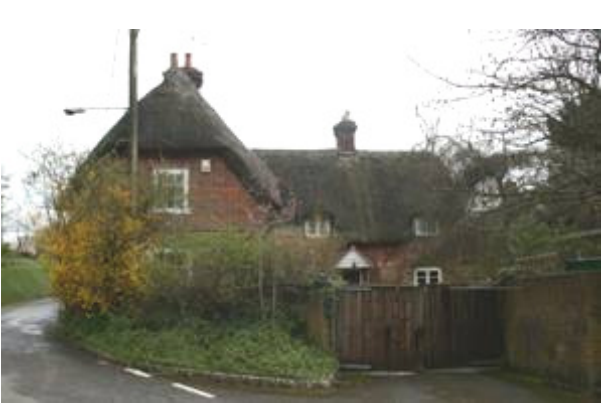
Figure 13: Sinodun, Grugs Lane.