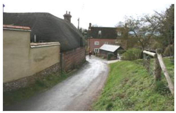
Figure 17: View of Sinodun and Pound House, Grugs Lane.