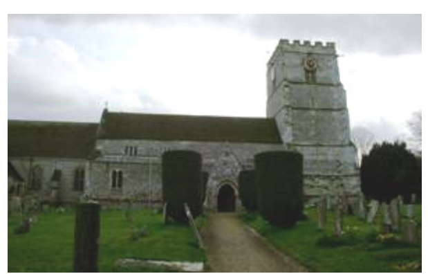
Figure 6: View of Cranborne Parish Church from the north.

The 16th century lay subsidy rolls suggest that the town may have entered a rapid decline following the dissolution of the priory in 1540,