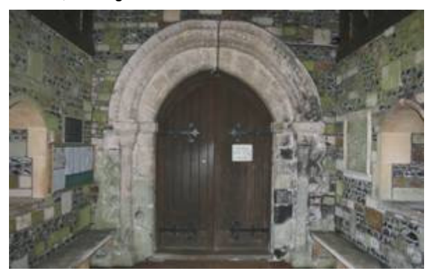
Figure 10: View of the 12th century north entrance to St Mary's and St Bartholomew's church.