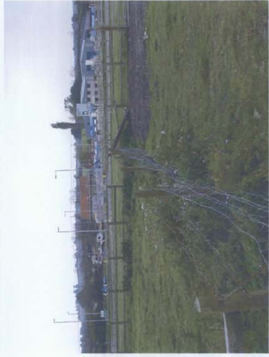
Figure 11: New roundabout and builders merchant from Park Farm R. F Burden

Figure 10 shows the thick, A-shaped hedges, that are characteristic of the fields of Park Farm. They are dominated by blackthorn and elm, with few substantial hedgerow trees. The trees to the right are part of a tree planting scheme, in association with the Gillingham Royal Forest Project. They are a mix of species, including willow, poplar, ash, field maple and oak. Figure 11 shows the new roundabout on the Shaftesbury Road. The building opposite is the builders merchants, highlighting the more industrial feel around the road. The buildings are in a low point, with the ground rising behind them to the west.