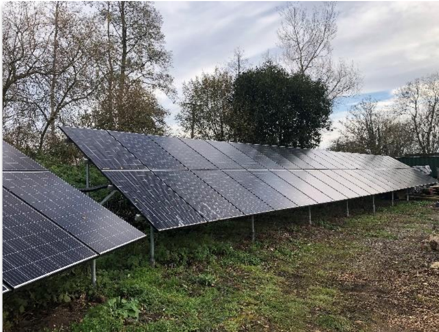
Figure 8: Solar photovoltaic panels situated in working yard, adjacent to compost heaps.