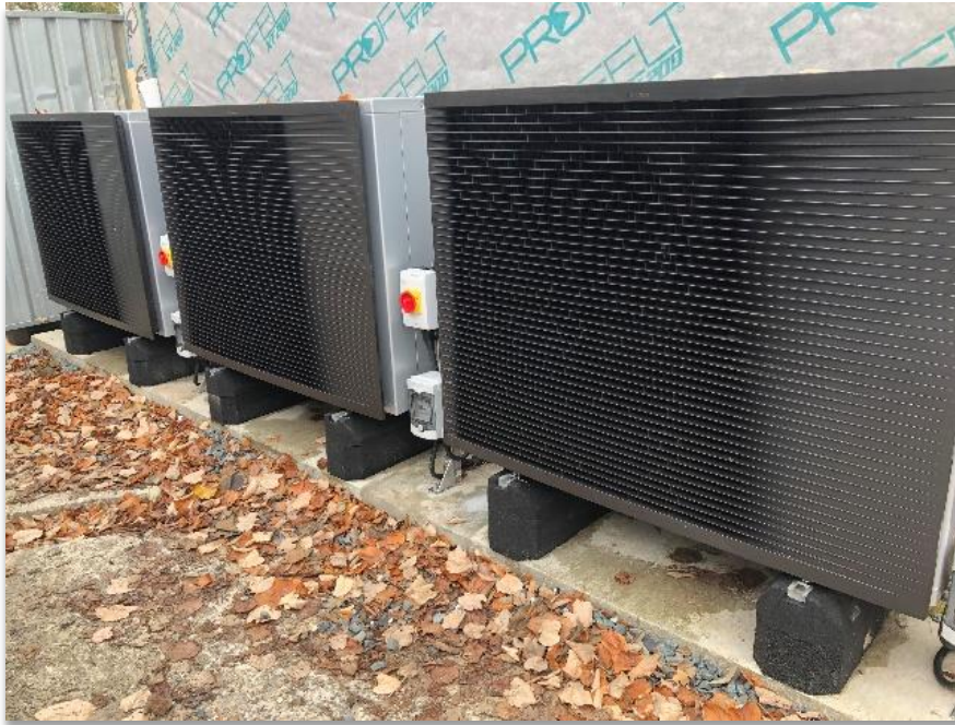
Figure 9: Air source heat pumps at the side of a modern building.