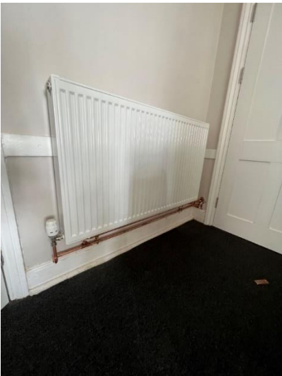
Figure 13: new radiators and pipework