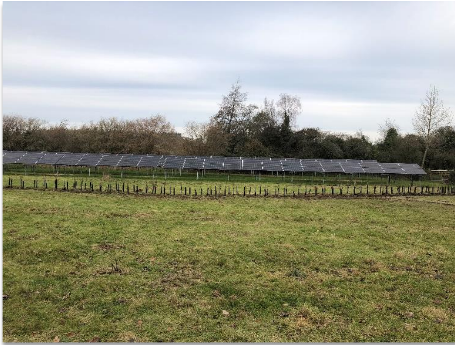
Figure 7: Solar photovoltaic panels and associated planting to the rear of the river cottage and outside the boundary of the listed park.