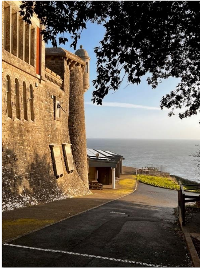
Figure 2: Durlston Castle showing solar panels installed.

4.1.6 Siting of the air source heat pump compound presented a number of challenges, dictated by the steep terrain surrounding the building, sensitive ecology of the site (including SSSI designations) and listed nature of the buildings. Several options were investigated and following ecological survey a site adjacent to the LPG tanks away from the main building was chosen. This involved laying additional underground pipework along the main access path and bringing a new power supply from a nearby substation. The final location balanced the environmental heritage sensitivities of the site, whilst providing a workable solution from an electrical and mechanical perspective.