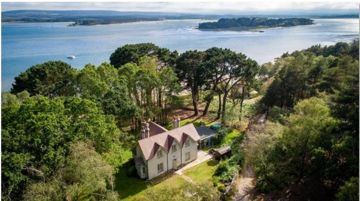
Figure 10. Aerial view of South Shore Lodge