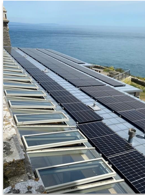
Figure 4: Installed solar panels