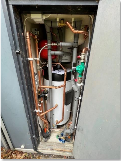
Figure 12: new heating system components in cupboard at South Shore Lodge