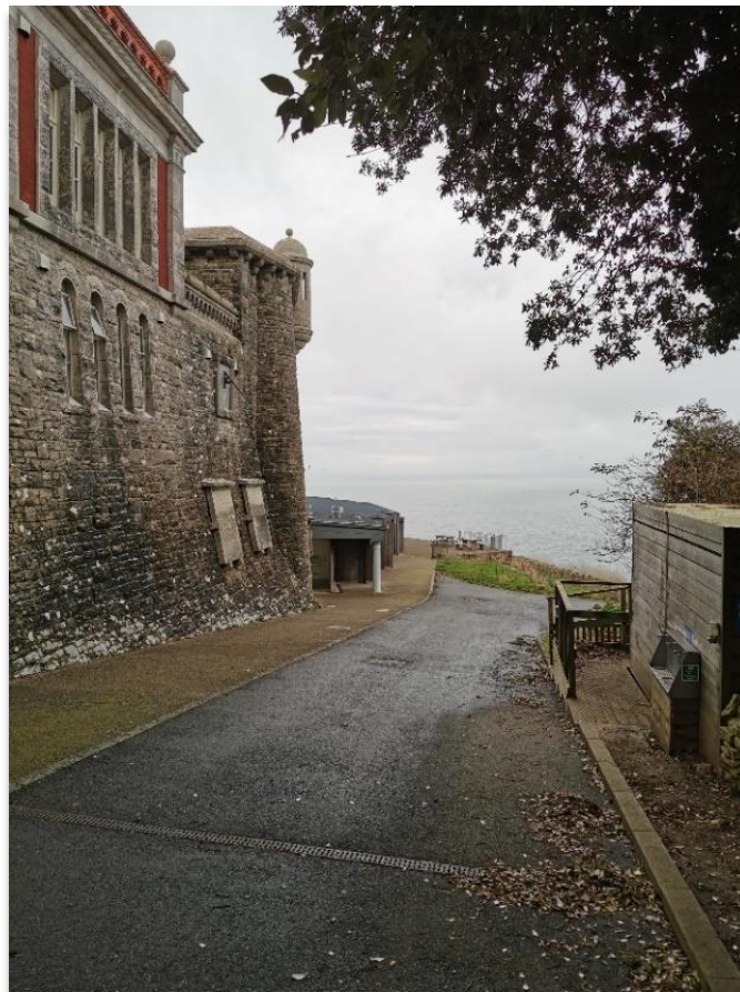
Figure 1: Durlston Castle before solar panels installed.

4.1.5 The design of the scheme was amended to install solar panels on the single storey modern extension to the rear of the Castle, and the application was approved. The photos below show the before and after views.