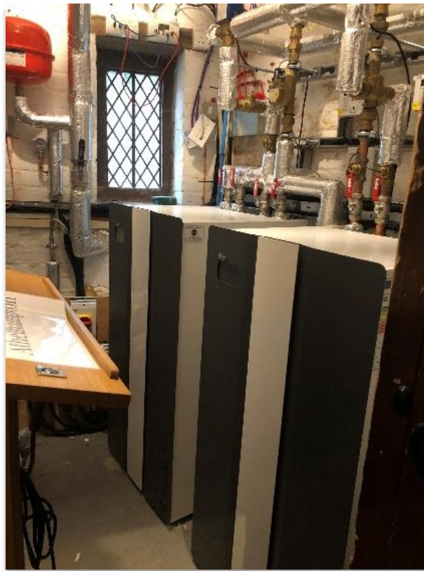
Figure 6: Ground source heat pump equipment sited in a room at the back of the building.

4.2.3 It is estimated that these improvements will save over 100 tonnes of carbon each year, with a payback time expected in the region of 7 years. The siting of the infrastructure associated with these works has been located to ensure it is not impacting the Listed Building or its setting.