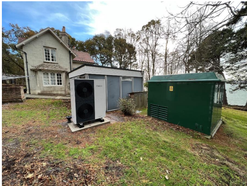
Figure 11: air source heat pump external unit in grounds of South Shore Lodge

4.3.5 These new heating systems are estimated to save 17 tonnes of CO 2 (equivalent) per year and will be complemented by the insulation the trust added during the refurbishment. The National Trust is now working to overcome some challenges related to heritage and fire safety to install low carbon heating systems in two more listed cottages on the island.