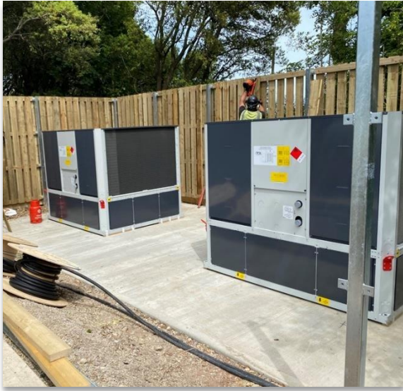
Figure 3: Air source heat pump