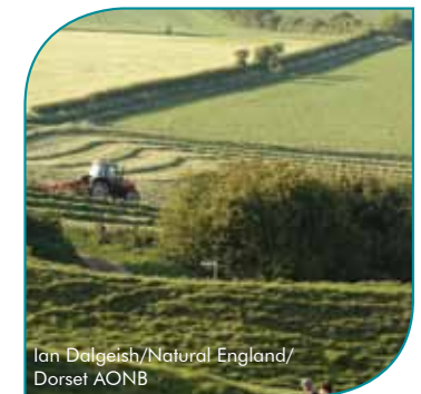
Ian Dalgeish/Natural England/ Dorset AONB