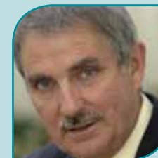
Chairman – West Dorset Partnership