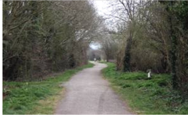
Figure 84: View east along the line of the former Somerset and Dorset Joint Railway, now a public footpath.

19 th century vernacular cottages: Pond Cottages, Ivy Cottage