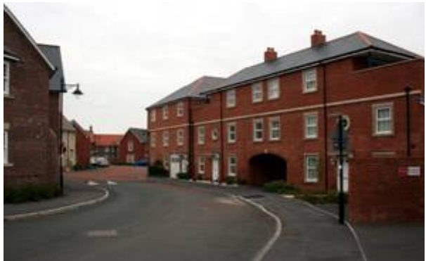
Figure 85: View of Drovers housing estate on the site of the former cattle market.