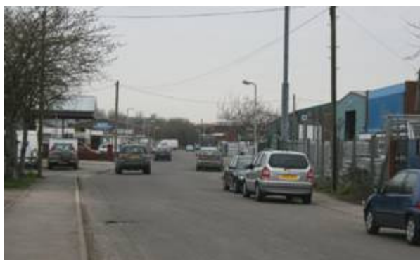
Figure 82: View north along the arterial road of Butts Pond Industrial Estate.

The settlement pattern essentially comprises modern industrial, commercial and public sector development on either side of Station Road. There is a small area of 19 th century or earlier ribbon development at Butts Pond consisting of small houses arranged in short terraces fronting on to the pre-existing main road (Figure 36). The housing estate on the site of the former Cattle Market consists of mixed detached, semi detached, short terraced houses and apartments set back from the street frontage within small plots arranged around linear culs-de-sac (Figure 85).