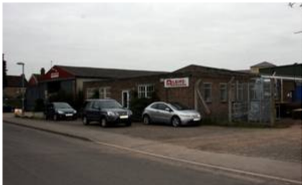
Figure 87: Mid 20th century industrial buildings, Butts Pond Industrial Estate.