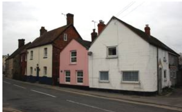
Figure 86: View of Pond Cottages from the south east.