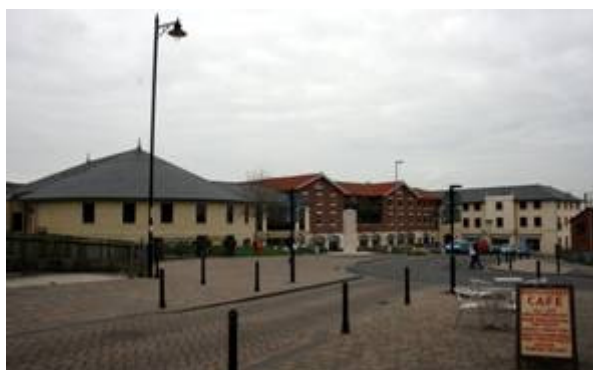
Figure 83: View from Station Road across the former railway to the redevelopment of the former cattle market site.