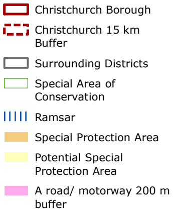
Figure 4.1: Trunk Roads Within and Around Christchurch Borough