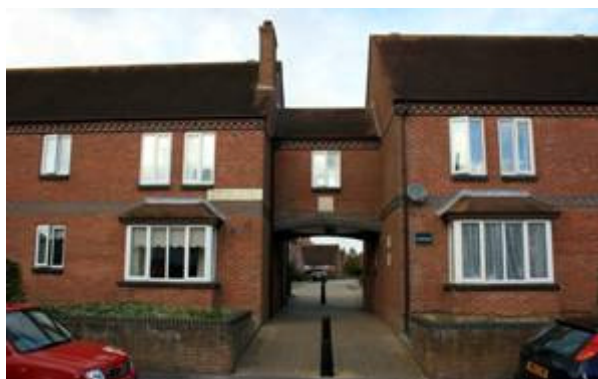
Figure 47: Bells Orchard housing estate.

44. Rempstone Centre . The Rempstone Centre was developed during the 1970s within the former gardens of the manor house on South Street. It includes a supermarket and a number of small retail outlets.