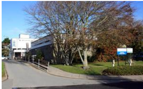
Figure 46: Wareham Health Centre and Ambulance Station.