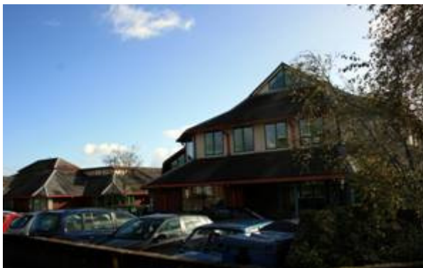
Figure 45: Anglebury Court.

27. Wareham Methodist Chapel. The late 19 th century chapel was demolished in 1972 and replaced by the present Methodist church.