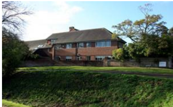
Figure 43: Westport House