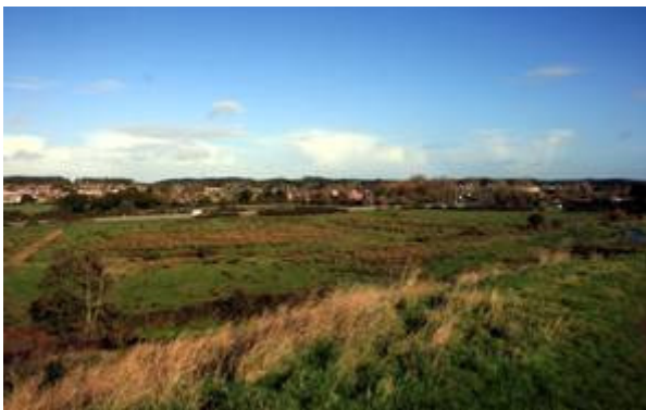
Figure 42: View across the Piddle floodplain towards Wareham by-pass and Northport.

A number of modern developments within the historic core, such as the Rempstone Centre and Anglebury Court (Figure 45), although fitted within the existing street pattern, are of a much larger scale than the historic urban grain.