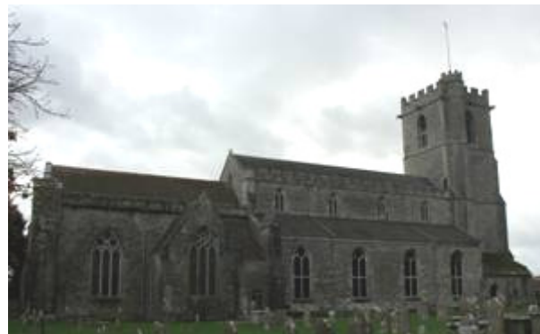
Figure 15: Lady St Mary's Church looking south. The Chancel (left) dates from the 14 th century and the tower (right) dates from the 15 th century. The intervening fabric dates from 1841 or later.