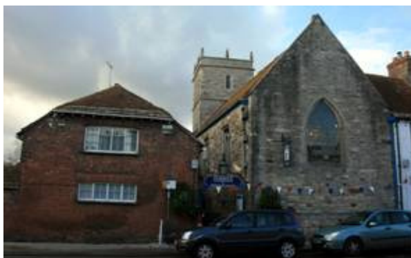
Figure 20: Holy Trinity Church.