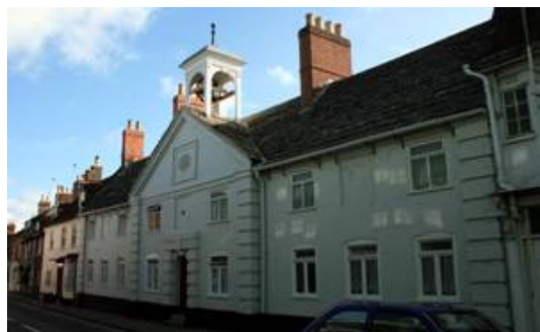
Figure 23: The former Streche's Almshouse, East Street.