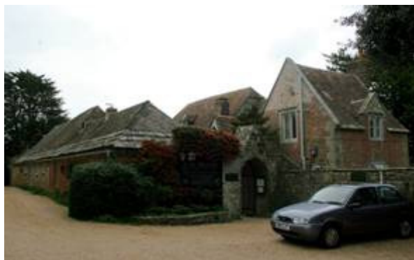
Figure 16: Priory House, the original 16th century wing lies to the rear in this photograph.

Teresa Hall has noted that there is some geographical grouping of the different types of street name in the town (Hall 2000, 56). The western half of the town contains occupational street names, such as Tanner's Land, Roper's