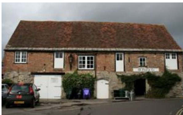
Figure 19: Warehouse, St Johns Hill, converted from a barn built in about 1500.

16. Pound Lane . This area was formerly the outer bailey of the Norman castle. The outer bailey ditch appears to have been filled in during the early 13 th century. Pound Lane and Trinity Lane developed along the edges of the former bailey. The area between may have been developed during the later part of this period, but evidence is lacking to confirm this.