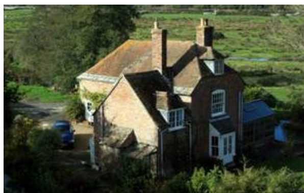
Figure 25: North Mill viewed from the North Walls.