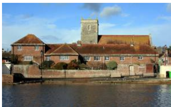
Figure 24: The Old Maltings, Abbot's Quay.

The existence of a number of 18 th century maps and plans means that for the first time there is a clear depiction of the town layout. In the 18 th century, the street pattern was similar to today, but with the addition of two further lanes in the