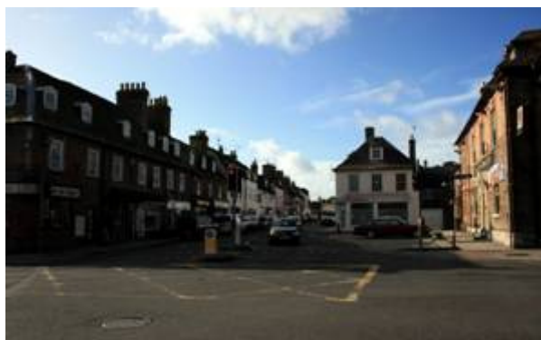
Figure 27: The Market Place looking west.

13. All Hallows' Chapel . All Hallows remained in use until at least 1631. It was converted into stables in 1774 and was later used as a ware-