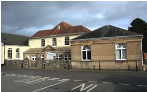
Figure 29: Old Meeting House, Church Lane.

20. North Bridge . Eighteenth century maps show a number of houses built adjacent to the north causeway or just inside the town walls.