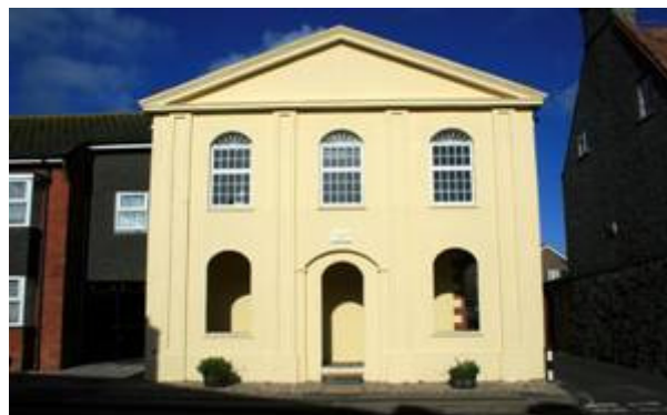
Figure 30: Churchwood Court, façade of former Congregational Chapel, West Street. Built 1789.

23. Barracks . A cavalry barracks was built at Westport between 1795 and 1800. It was closed and demolished in about 1816.