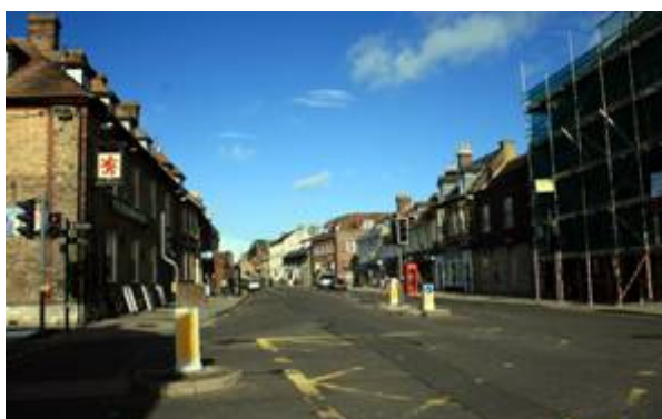
Figure 21: View north along North Street. Prior to the great fire in 1762 shambles ran along the centre of North Street.