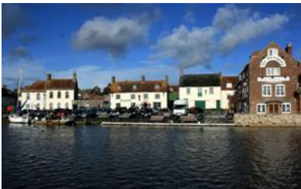
Figure 22: View of The Quay from across the River Frome.

Religious non-conformity came early to Wareham. In 1672 the house of Dorothy Chapman in Wareham was granted a licence to function