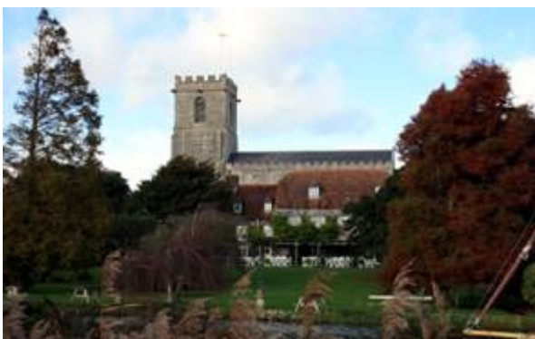
Figure 14: View of the 16th century Priory House on the south side of Lady St Mary's Church.

The Lay Subsidy of 1322 suggests that there were only 27 taxpayers in the town. This was the same number as the newly established and rival port of Poole but considerably less than successful Dorset towns such as Shaftesbury and Sherborne (with over 100 taxpayers each), Weymouth and Melcombe Regis (with over 60 taxpayers) and Dorchester (with 53 taxpayers). Furthermore, most of the taxpayers in Wareham paid only a small amount of tax, suggesting a relatively poor town with no very wealthy inhabitants (Penn 1980, 110; Mills 1971). The Black Death appears to have hit Wareham hard, with seven priests recorded as dying in 1348 alone, and may have helped accelerate the decline of the town. Wareham seems to have become a small market town and minor port, dependent on local trade. The location of