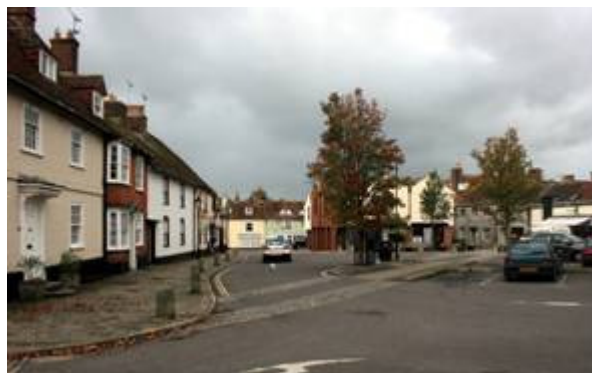
Figure 17: View west along St John's Hill.