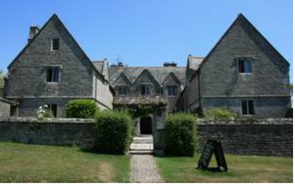
Figure 14: Morton's House, East Street (built circa