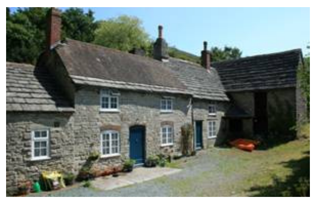
Figure 18: Boar Mill