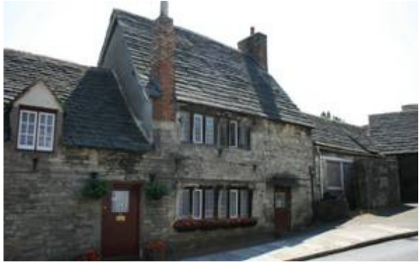
Figure 13: Uvedale's House, 17-21 East Street (built circa 1575).

The trade in Purbeck marble was in decline from the mid 16th century and appeared to cease completely by about 1700. There was an increase in demand for Purbeck stone in the 18th century, but the stone was shipped out via Swanage, rather than being transported through Corfe to the guay at Ower. Nevertheless, there were many The late 18th century Universal British Trade Directory states that the only trade is stone and knitted stockings. Most of the traders listed in Corfe were stone masons or clay merchants. The extraction of Ball Clay in the region around Norden, immediately to the north of the Purbeck Ridge was initially stimulated by the introduction of tobacco in the 16th century and the need to produce clay pipes. However it was the patronage of Josiah Wedgwood in the late 18th century that greatly accelerated the extraction of Ball Clay in the region. The clay was exported from Poole Harbour to Liverpool by sea and thence to the Staffordshire potteries in quantities of up to 1400 tons per year (PMMM 2009). A remarkable private census was carried out by William Pitt in 1796 which showed that 55 clay cutters. 16 stonemasons and 10 quarrymen lived in the parish of Corfe Castle during the late 18th century. This census is very informative with re-