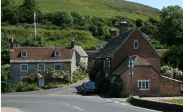
Figure 19: Bridge Cottage (right) and Cromwell Cottage (left) Sandy Hill Lane.