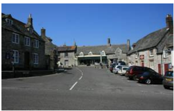
Figure 9: View of The Square looking west.