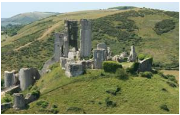
Figure 6: View of Corfe Castle Keep and Gloriette.

The grant of a hide for William's castle probably included the area later occupied by the town, although there is no evidence for a town on the site until King John granted a weekly Saturday market to his men of Corfe in 1215 (Legg 2004, 64). Nevertheless, the initial construction of the castle and its 12<sup>th</sup> century remodelling in stone is likely to have brought many artisans to the area. The town may have originated as a construction camp, which later gained economic independence through the development of quarrying and stone-working industries. The trade in Purbeck marble was