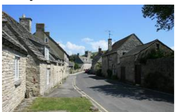
Figure 12: View east along West Street.