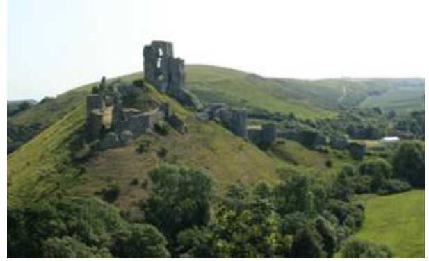
Figure 8: View of the castle looking east showing the Keep (centre left), West or Middle Bailey (left foreground) and Outer Bailey (right background).

There were areas of medieval strip fields to the south and west of the town shown on Treswell's map, West Hawes and Middle Hawes have some strip boundaries are preserved as hedges or slight earthworks (Penn 1980; RCHME 1970).