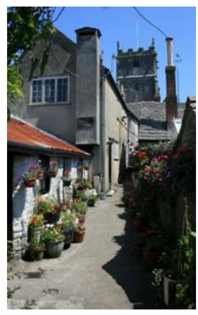
Figure 11: View of the medieval burgage plot at the Fox Inn garden.

largely worked in Corfe itself. However, more recent evidence suggests that most of the working and finishing of the marble was done at the quarries and the existence of marblers' 'bankers' in West Street remains unproven (Blair 1991).