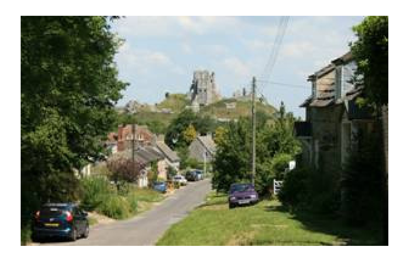
Part 5: Historical Analysis