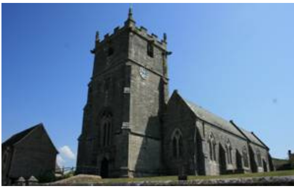
Figure 7: View of St Edward's Parish Church.