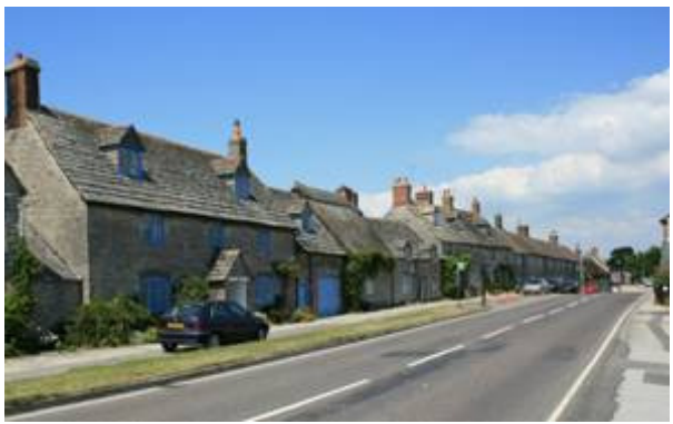
Figure 15: View north along East Street.

1. The Castle. Queen Elizabeth sold the castle to Christopher Hatton in 1572 and it was Hatton who commissioned the Treswell surveys of the Castle and town in 1585-6. The features missing from this plan must have been constructed after this date and most likely in preparation for sieges during the Civil War. Prominent among these is the Bastion projecting from the southern wall of the inner ward seemingly built for cannon commanding the entire town and its approaches. The castle passed to the Bankes family in 1635 and was held for the king by Lady Bankes, enduring many sieges from 1643-1646. It was only captured through intrigue, rather than being defeated militarily. Its destruction was ordered soon after by Parliament. The damage was too