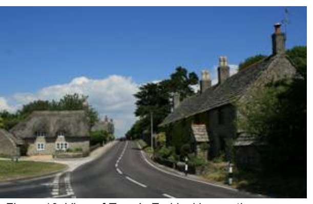
Figure 16: View of Town's End looking north.