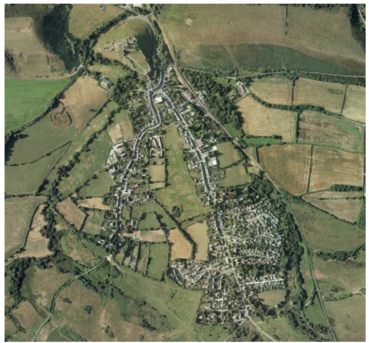
Figure 1: Vertical aerial photographic view of Corfe Castle, 2005.

Purbeck Vale, and it is the interrelationship between the two, emphasised and framed by the dramatic landscape, that greatly enhances the town's historic character.