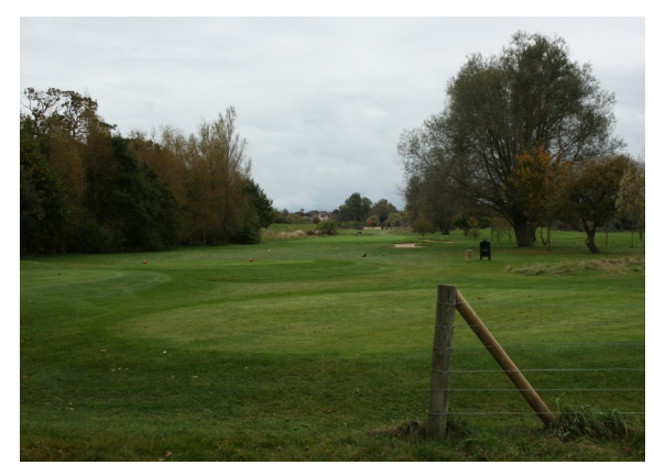
Figure 96: Iford Golf Course