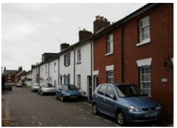
Figure 72: Avon Buildings and Royalty Fishery House