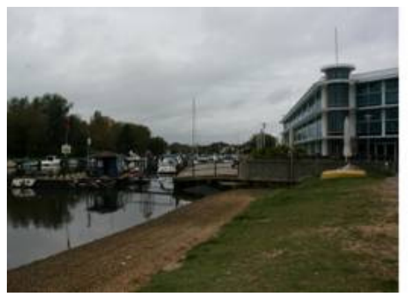
Figure 67: Wick Ferry and Captain's Club Hotel