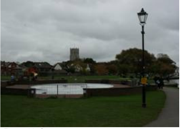
Figure 66: Quomps