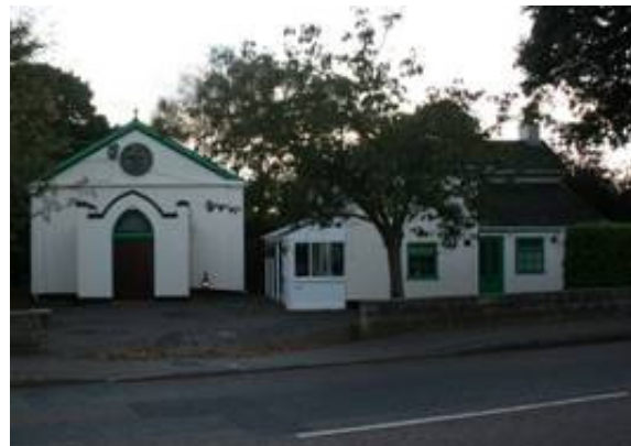
Figure 161: Walkford United Reformed Church