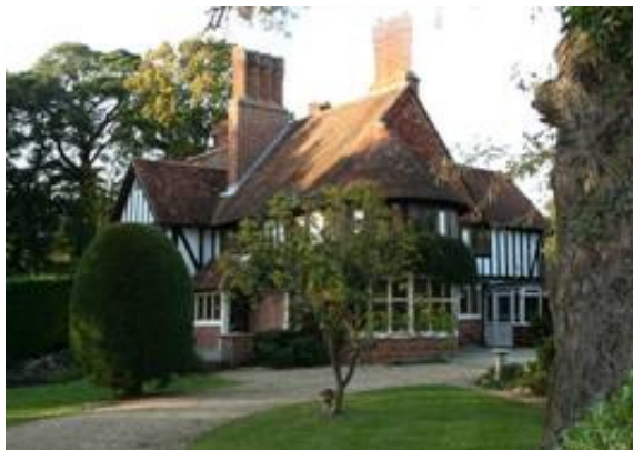
Figure 160: : Amberwood House