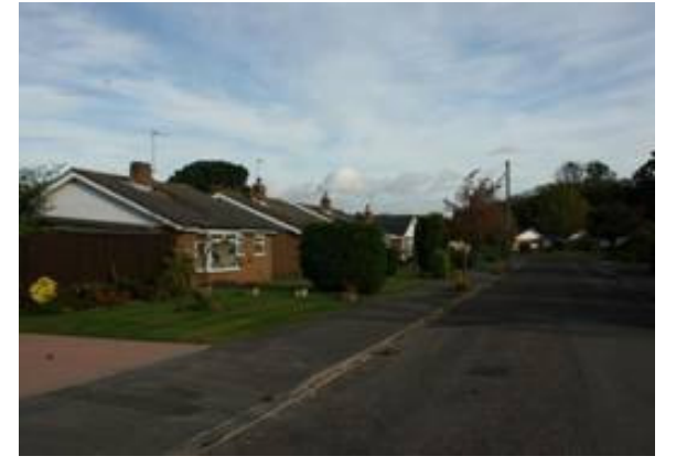
Figure 151: The Meadway