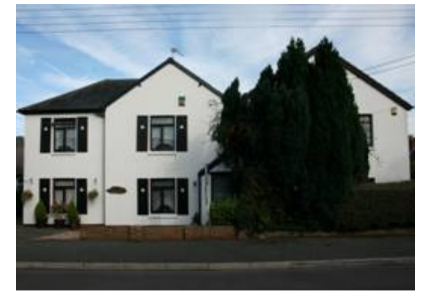
Figure 152: 75-7 Smugglers Lane North