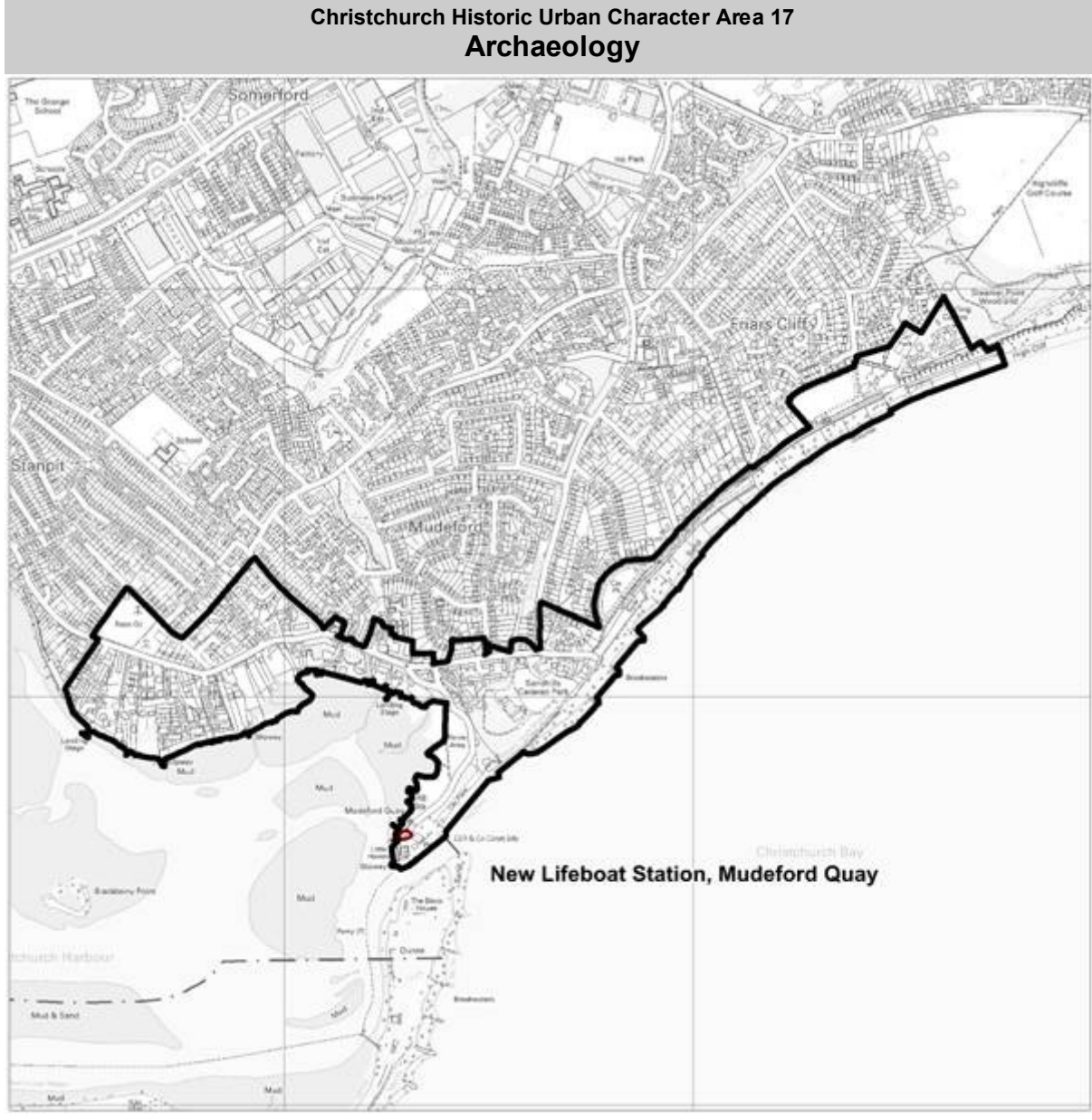
Figure 136: Archaeological features in Historic Urban Character Area 17