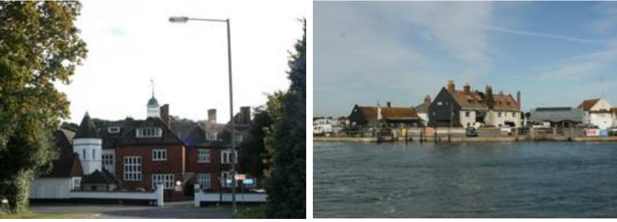
Figure 134: The Anchorage