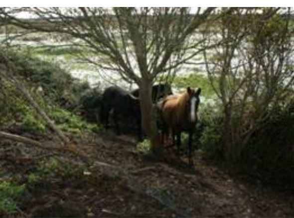
Figure 114: New Forest Ponies on Stanpit Marsh