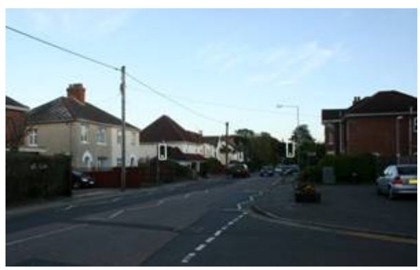
Figure 49: Walkford