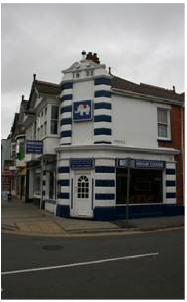
Figure 50: 105 Bargates of 1902

58. Mudeford Lane housing estate. The major development in the early 20<sup>th</sup> century involved the laying out of the Mudeford Lane housing estate during the 1930s. This occupies the area of the former Stanpit Field, common land lying between Mudeford Lane and Stanpit. Pauntley Road, Victoria Road, Queen's Road and Ledbury Road were laid out by the 1930s, Lingwood, Foxwood and Caroline Avenues were added before 1947.