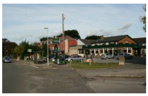
Figure 48: Friars Cliff