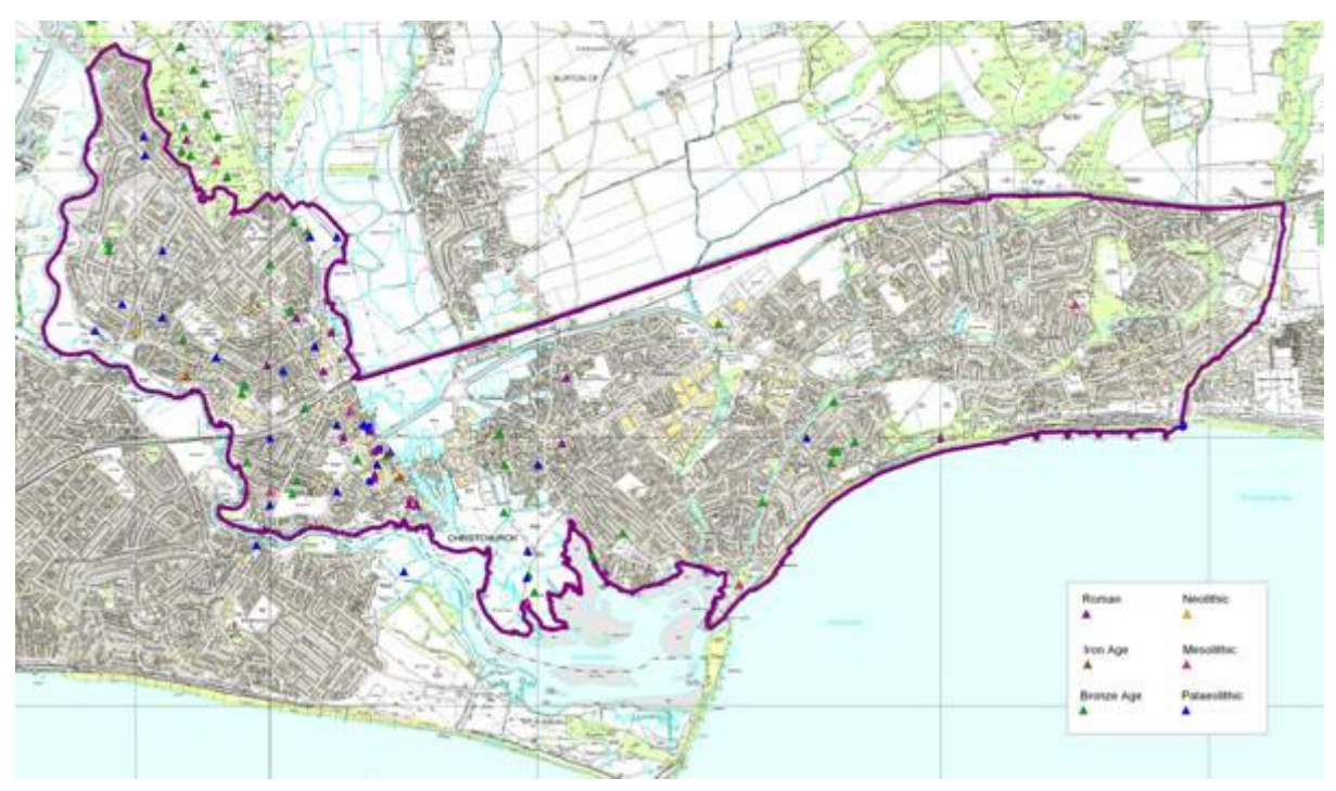
Figure 6: Christchurch Pre urban plan components

There is slight evidence for small dispersed settlements in the Christchurch area at Burton Road, Purewell and Mill Plain. Significant quantities of Roman pottery have also been recovered during excavations within the Saxon burh at Christchurch. None of these finds have been from in situ Roman deposits, but may indicate the former presence of a Roman building (Jarvis, 1985a). 20kg of Roman tile were incorporated as lining for a mid-late Saxon oven or corn dryer at the Town Hall car park. This certainly suggests the presence of a Roman building, still visible in the middle Saxon period, near to the historic town, (Jarvis 1983, 34-6).