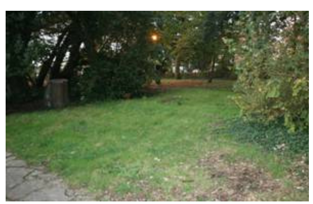
Figure 9: The Northern burh defences

There is little archaeological evidence for activity within the late Saxon burh. Two parallel ditches of uncertain function were excavated at site X10 (Town Hall car park) during 1974. They are aligned parallel to and east of High Street, possibly terminating at the defensive bank immediately to the north. These contained Saxo-Norman pottery within their silts suggesting that they went out of use at this time. They also cut a middle Saxon oven and might possibly have been constructed in the late Saxon period. Jar-