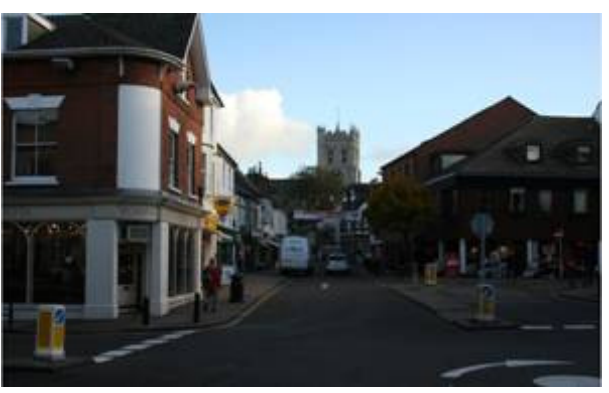
Figure 8: The area of the probable late Saxon settlement