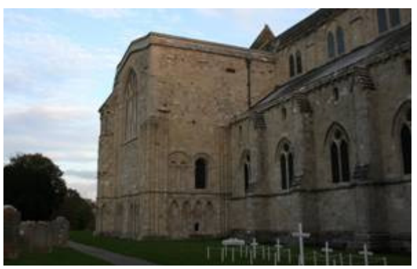
Figure 7: The Priory Church which may incorporate the remains of the late Saxon Minster.

Evidence for the layout of the late Saxon town comes from a number of disparate sources including archaeological excavations, documents and analysis of the town plan. Regardless of whether the late Saxon burh defences formed a 'playing card' shape or a promontory burh, the organisation of the late Saxon town is