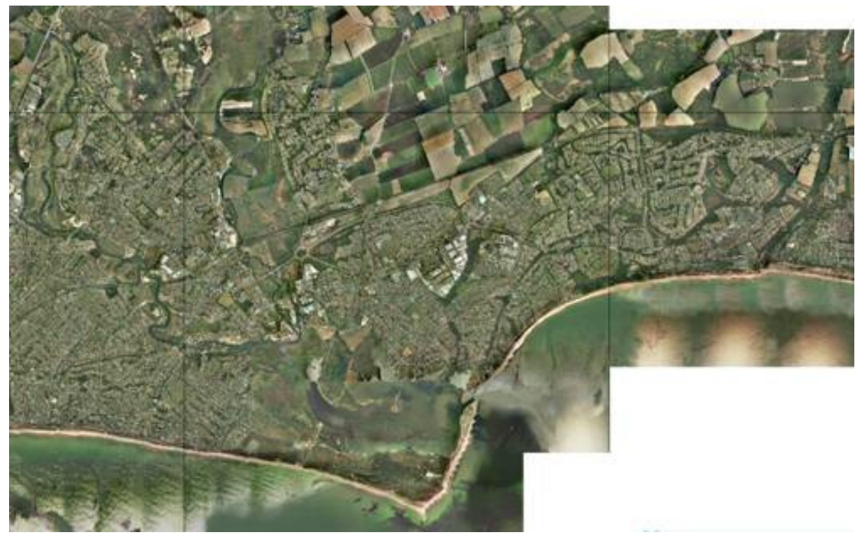
Figure 1: Vertical aerial photographic view of Christchurch, 2005.

cluded on the grounds of the quality of the renovated house and grounds. The hospital and workhouse is a conservation area with important historic buildings as well as depth of social history.