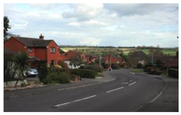
Figure 84: View south along Larksmead, from Salisbury Road.

Mature trees are not common in this area and tend to be restricted to former sections of hedgerows preserved within the suburban landscape. There are occasional examples of mature walnut trees planted by the owner of the Damory Court estate in the early 20<sup>th</sup> century (Sackett 1984, 83).