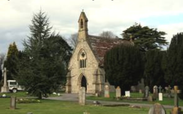
Figure 88: Victorian gothic mortuary chapel, Blandford Cemetery, Salisbury Road