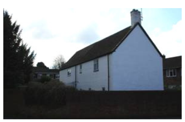
Figure 86: 1 Fisher's Close, Wimborne Road

Vernacular houses and cottages: Damory Court Cottages (89 Salisbury Road); Cemetery Farmhouse (11 and 12 Dairy Field); 1 Fisher's Close.