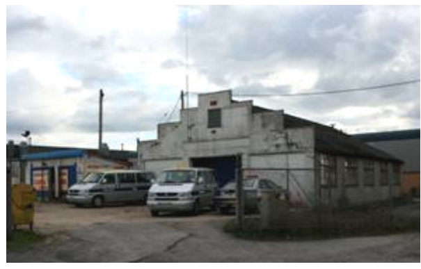
Figure 91: 1950s industrial building, Blandford Heights Industrial Estate, Shaftesbury Lane.

There are no scheduled monuments within the Character Area.