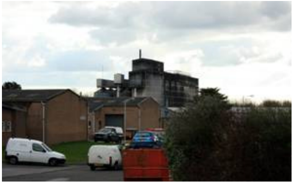
Figure 41: View west of Blandford Heights Industrial Estate, with the BOCM animal feed mill dominating the skyline.