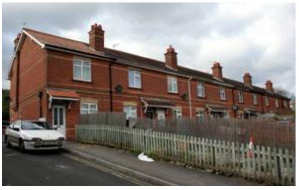
Figure 33: St Leonard's Terrace