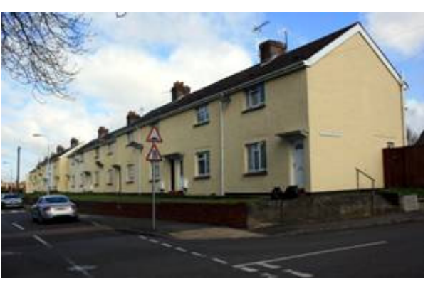
Figure 30: Inter-War housing, Langton Road