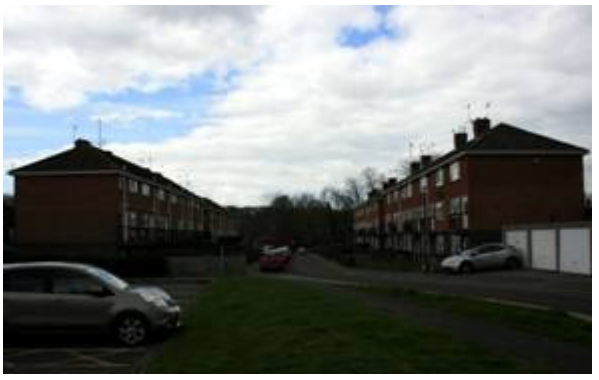
Figure 39: Eagle House Gardens.