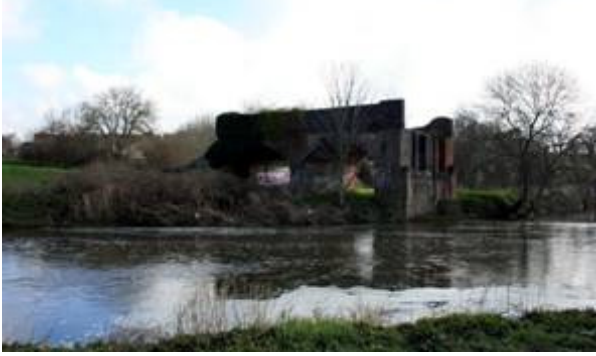
Figure 40: A short surviving section of the former railway bridge over the River Stour.