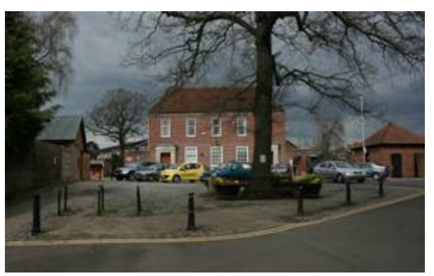
Figure 32: View north across Sheep Market Hill to the Post Office