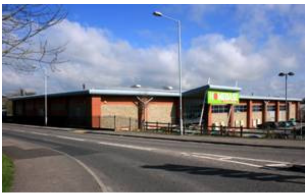
Figure 34: Homebase Store, Blandford St Mary. Architectural fragments salvaged from the former Blandford St Mary Primary School have been set into the wall on the left.

The bounds of Blandford Borough had been extended in 1935 to include the area of the station suburb, Salisbury Road as far as Cow-