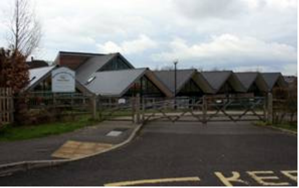
Figure 37: Blandford St Mary Primary School, Birch Avenue.