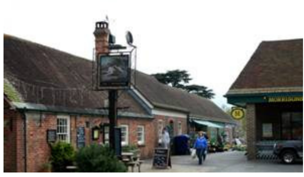
Figure 36: View of Greyhound Yard (left), a former burgage plot, with Morrisons Supermarket on the right.