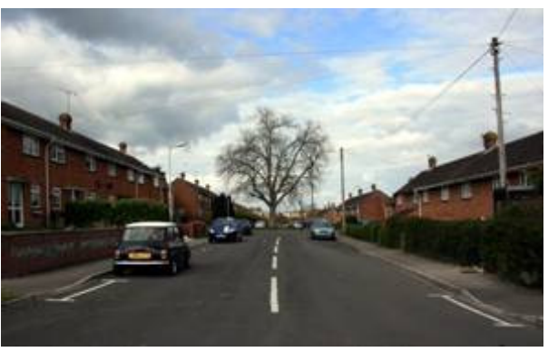
Figure 42:Post-war housing estate, Elizabeth Road, with prominent walnut tree in centre.