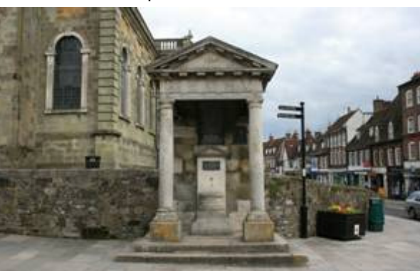
Figure 15: The Fire Monument, Market Place