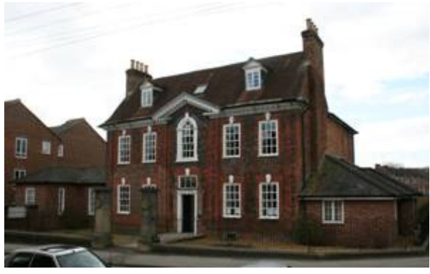
Figure 18: Eagle House, White Cliff Mill Street