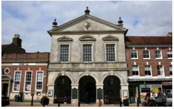
Figure 14: The Georgian Town Hall, Market Place

The rapid and charity-aided reconstruction meant that the economy of the town was not adversely affected in a disproportionate manner. Nevertheless, there was a certain amount of disorder and poverty during the mid 18<sup>th</sup> century. In 1738 only 20 innkeepers were licensed because of a large number of disorderly events. The situation soon normalised and in 1757 Archbishop Wakes Bluecoat School was