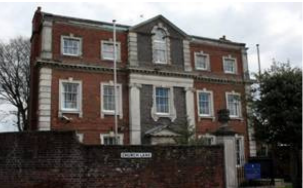
Figure 20: Coupar House, Church Lane