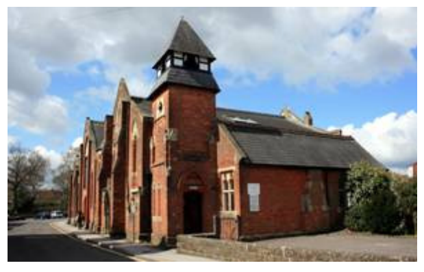
Figure 17: Wesleyan Methodist Chapel, The Tabernacle