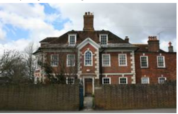
Figure 13: Dale House