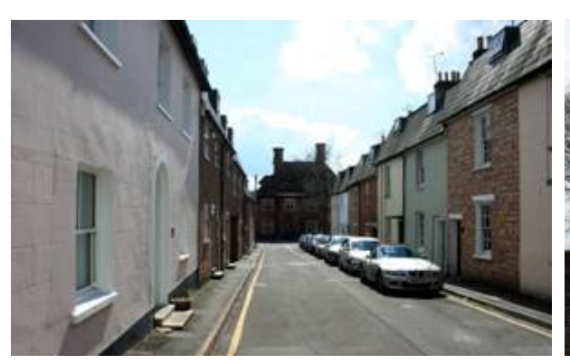
Figure 19: View south along Dorset Street towards The Old House