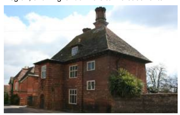
Figure 12: The Old House