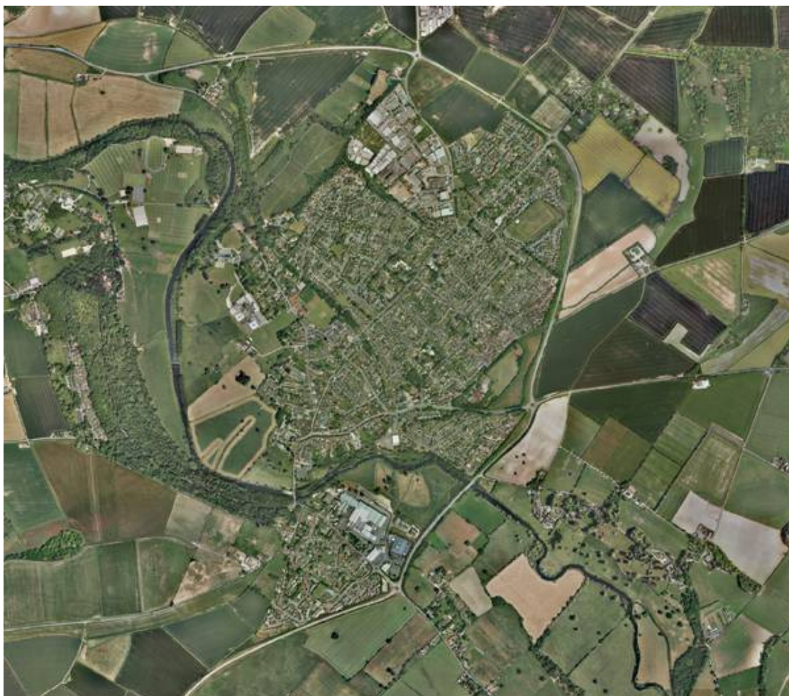
Figure 1: Vertical aerial photographic view of Blandford Forum, 2005.

its suburb of Blandford St Mary. The wooded cliffs and former deer park at Bryanston provide a distinctive backdrop for the town to the west. These features have meant that the natural expansive direction for the modern town has been up the sloping chalk ridge to the north east.