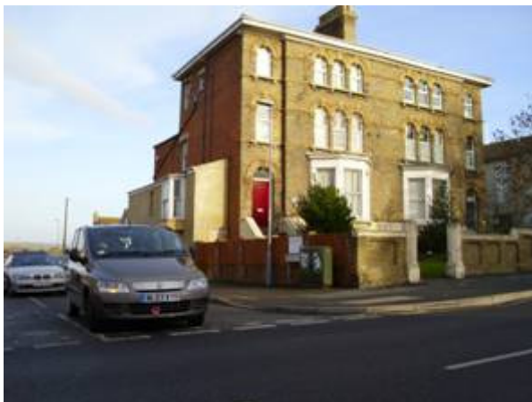
Figure 106: Dorchester Road, Late 19th century villa

There are several open spaces in this area. The most significant are the paying fields associated with the college as well as separate playing fields on the eastern side of the area, as well as the ground surrounding the industrial estate. Lodmoor nature reserve to the east can be seen from many parts of this area.