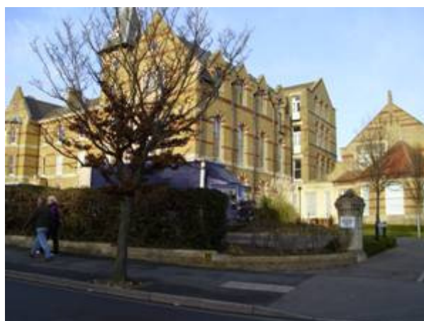
Figure 104: Dorchester Road, former Weymouth Technical College