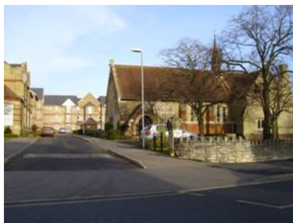
Figure 105: Dorchester Road, former Weymouth Technical College chapel