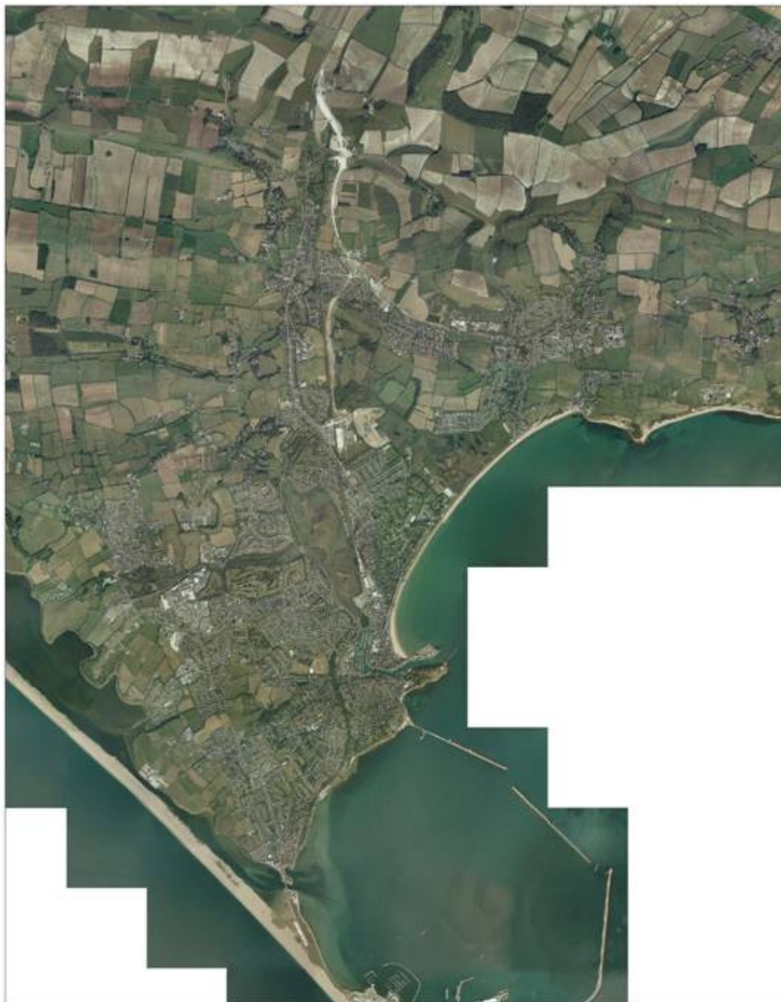
Figure 1 Vertical aerial photographic view of Weymouth, 2005