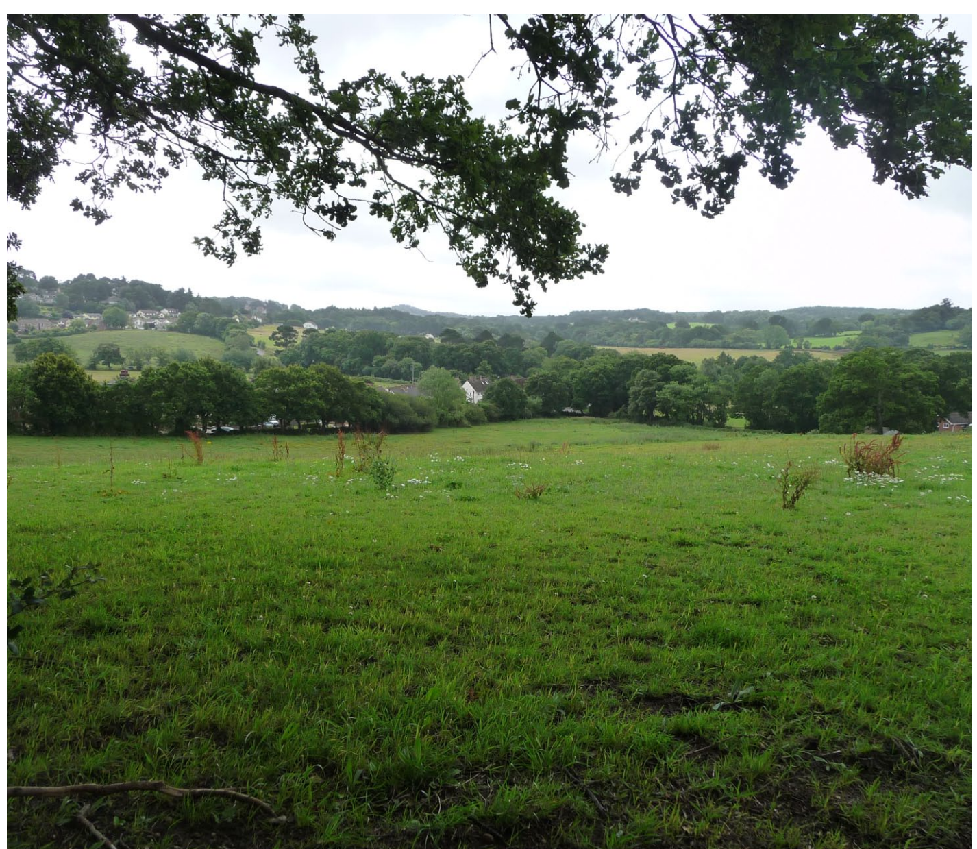
Land west of Ridgeway, West Parley

Land adjoining Pardy's Hill, Corfe Mullen