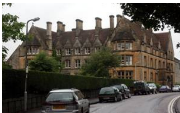
Figure 52: The former Digby Hotel, Digby Road