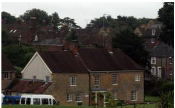
Figure 44: Newell Grange; now part of Sherborne International College