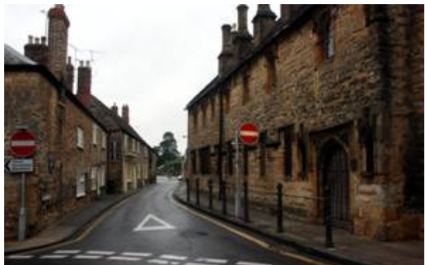
Figure 43: View West along Trendle Street