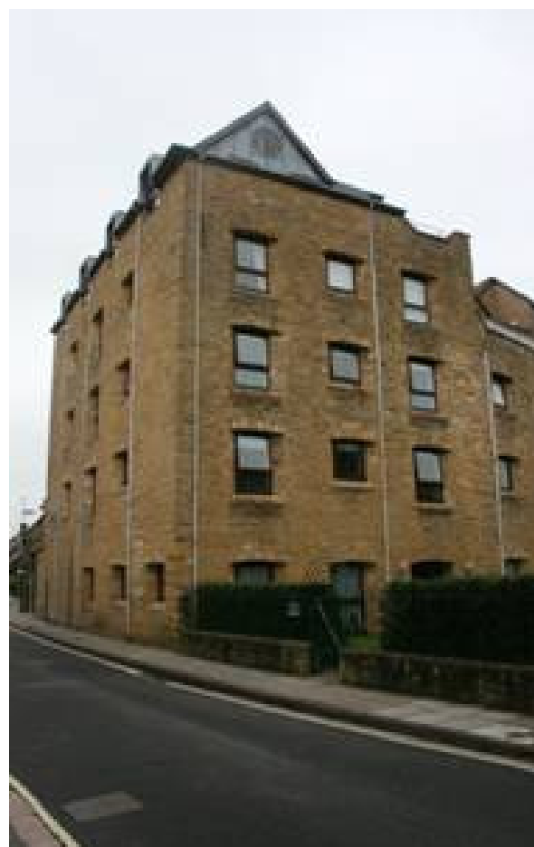
Figure 48: The Maltings, Long Street; the former Dorsetshire Brewery