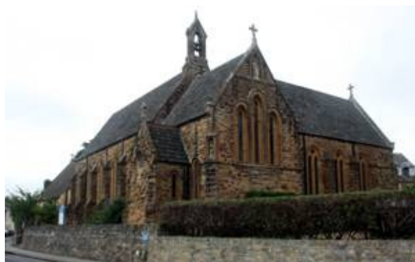
Figure 51: The Roman Catholic Church of the Sacred Heart and St Anselm, Westbury