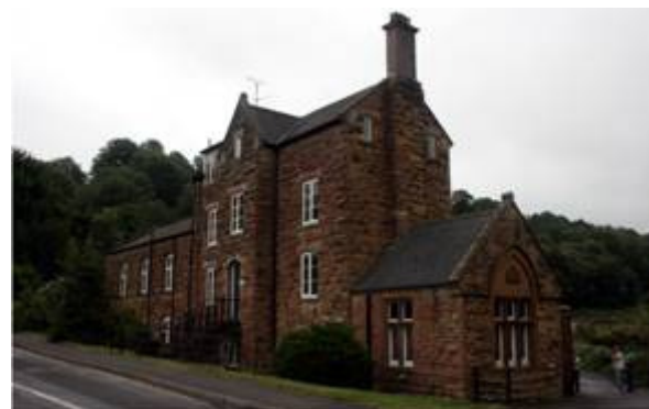
Figure 47: Hillside, Gas House Hill; Former Gas Works buildings