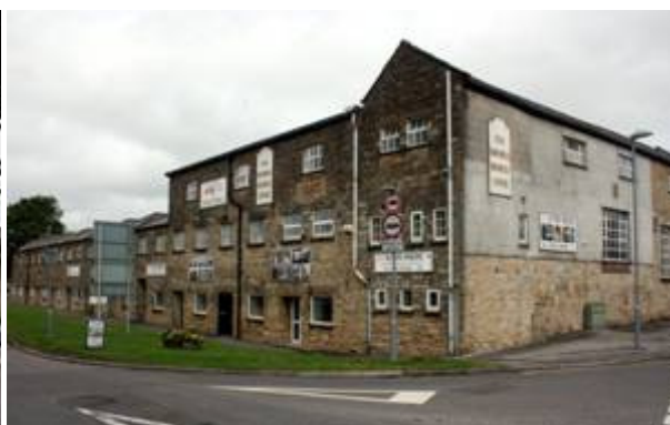
Figure 55: Old Yarn Mills Business Centre, Ottery Lane