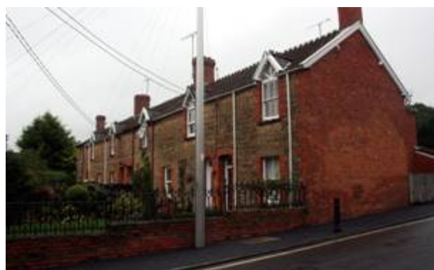
Figure 63: Sunnyside Terrace, North Road