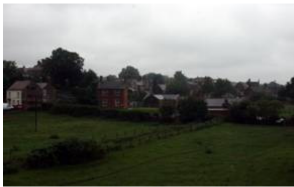
Figure 41: Castleton, Osborne Road with Castle Farm in the right background.