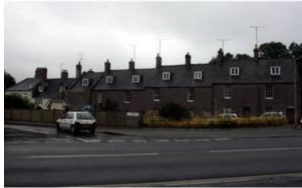
Figure 42: Castleton Terrace with the site of the former Castleton Mill in the foreground

The rural economy remained important during the 19 th century. Hutchins recorded three commons; Lenthay, The Mead and The Moor ... the whole except the Moor, firm and fertile...two thirds of the land are arable, some meadow, the remainder pasture. The soil produces excellent wheat and barley, some oats, flax,