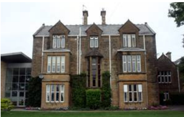
Figure 65: Acreman House, Sherborne Preparatory School

44. Golden Ball . This small suburb of Sherborne, located 0.5km north of The Green on the Bristol Road, is recorded on the 1 st edition OS 25 inch map in the late 19 th century. However, an earlier origin is possible, as the name appears to be common among coaching inns of the mid 18 th century. The Sherborne example is specifically associated with a locally-listed 19 th -century house at the junction of Bristol Road and Blackberry Lane on the site of a former toll house (Dorset County Council, 1973, 3/303). Thus the small settlement may have grown up following the turnpiking of the Bristol Road (1752-3). The houses in this area date from the 18 th and 19 th centuries and tend to be in local stone rubble (with brick dressings in the 19 th century) and plain tile or slate roofs. Two large reservoirs were established in the area in the mid 19 th century to supply Sherborne with clean drinking water.