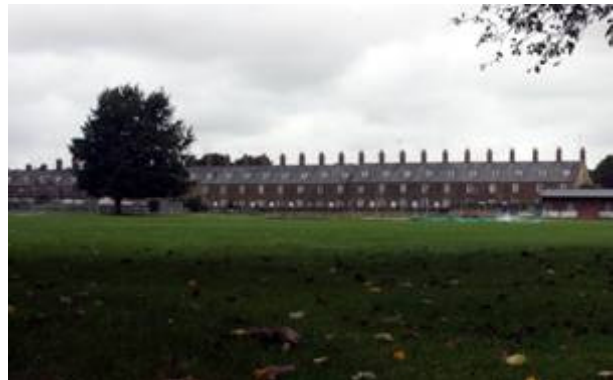
Figure 61: Horsecastles Terrace, Horsecastles