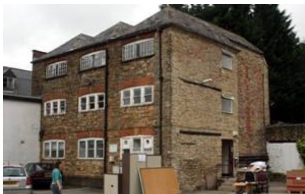
Figure 54: Westbury Mill