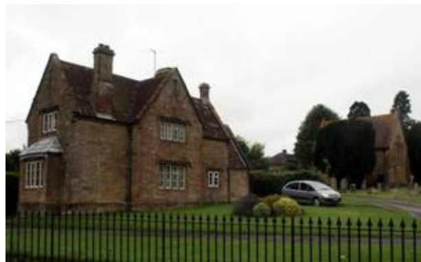
Figure 62: Lenthay Cemetery Lodge