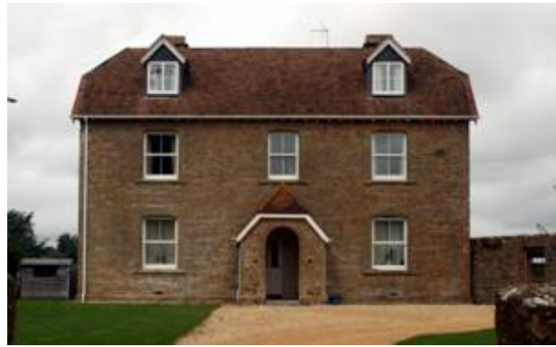
Figure 56: Hyle Farm House

5. St Andrews Mill. The mill is documented up to 1814 (Field, 1997) when it was sold together with silk throwing equipment. This suggests that by this date it had become part of the burgeoning Sherborne silk throwing industry (Marsden, 1980, 4). Stone buildings incorporated into the now demolished Wincanton Engineering works were probably remnants of the silk mill. J Ayres' map of 1802 shows that the mill was then known as Melmoth's Mill (Field, 1997). A mill leat marked on the map was only finally filled in