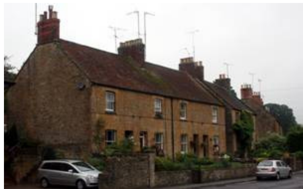
Figure 57: Coombe Terrace, Nethercoombe