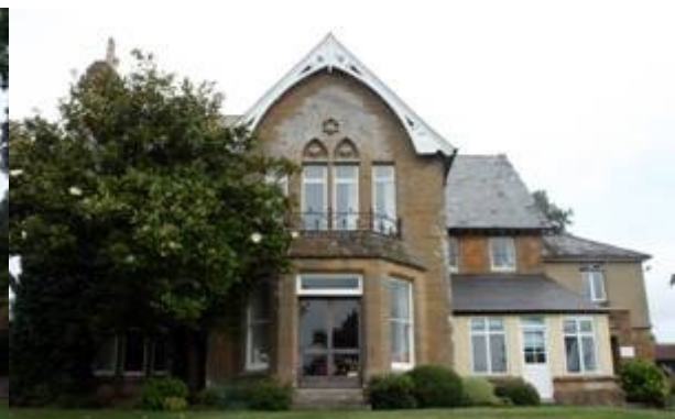
Figure 66: Netherton, Sherborne Preparatory School

48. St Anthony's Convent . The St Anthony's convent building (originally known as Maperty Hall) was built in 1891. It is now St Anthony's school house. The neighbouring Roman Catholic church of the Sacred Heart and St Aldhelm (Figure 51) was built in 1893, also in rock-faced stone and holds a considerable presence in the townscape (WDDC, 2007, 49).