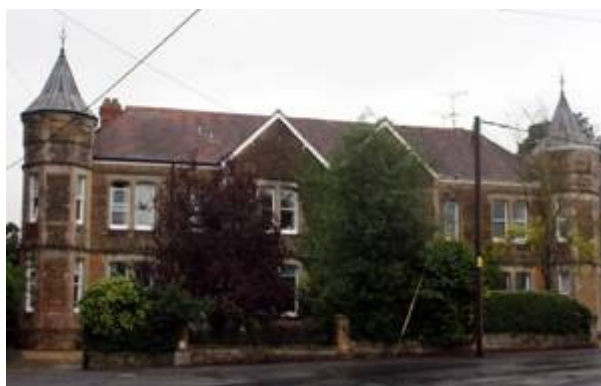
Figure 64: Bailiwick, The Turret and Pencarrow, The Avenue

40. South Street . This road became busier following the construction of the station and new Victorian and Edwardian suburban villas were built along its western side. Large town houses such as Gainsborough House and Ludbourne Hall were also built at the southern end of the Street. Hutchins records that the county bridewell continued on this site until 1793 when the prisoners were removed to the newly-built Dorchester Gaol. The buildings were then converted into a brewery. Hutchins maintained that ...some remains of a church-like building may still be traced in the dwelling houses (Hutchins, 1873, 284). Barker adds that that the site was in use as a printing works by 1834 and in 1930 it was a petrol filling station (Barker, 1990, no 116). The rear of the site has recently been redeveloped for housing, although Bridewell Cottage (Figure 18) has a 19 th century frontage and possibly an earlier core (Department of the Environment, 1973, 149).