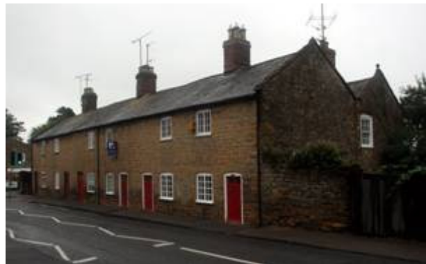
Figure 59: Numbers 1-6 Coldharbour