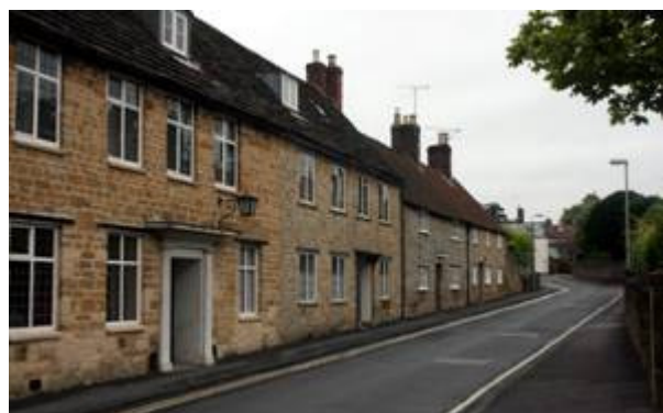
Figure 45: Numbers 43-49 (odd) Hound Street