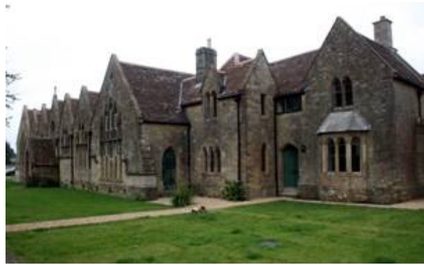
Figure 60: The former Sherborne Abbey Primary School, Horsecastles

27. Kitt Hill Cottages . Settlement extended further along Kitt Hill west of Barton Farm during the