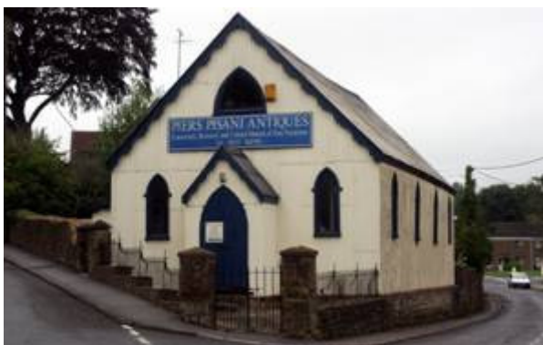
Figure 50: The former Marston Road Tabernacle