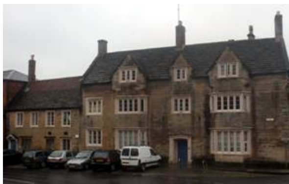
Figure 46: Greenhill House, The Green

Considerable additions were made to SS John's Almshouse in 1886. This included further living quarters to the east with a board room above, the whole fronted by a forecourt, sunny cloister and a bell tower (Gourlay, 1967).