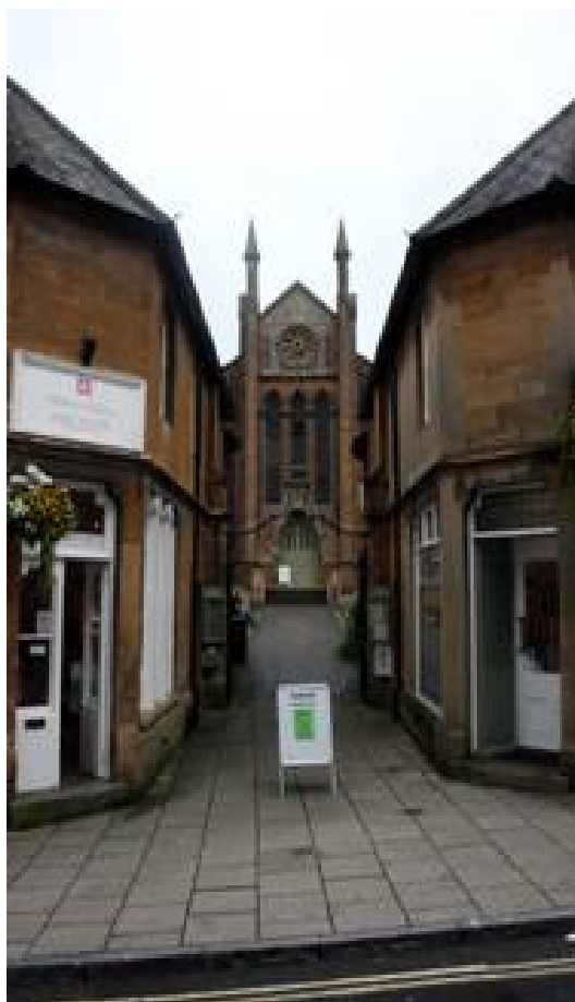
Figure 53: Cheap Street Methodist Church

The main plan components of the twentieth century town are shown on Figure 49 and are listed below.