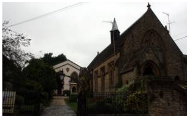
Figure 58: Long Street Congregational Chapel and Schoolhouse