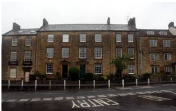
Figure 40: The Georgian Buildings of Greenhill Court, Greenhill; the site of the former New Inn

The first Turnpike act relating to Dorset was dated 1752-3. It was at this time that the A30 and the Wincanton Road (B3145) were turnpiked. It also affected the Sherborne to Dorchester Road (A352) which from this time passed to the west of Sherborne along Horsecastles Lane and Ottery Road to West Bridge. Further Turnpike acts were passed in 1755-6 and 1788 making minor alterations in the Sherborne area (Andrews, 1987, 23-4). There was a major alteration to the turnpike Road between Sherborne and Dorchester at West Hill in 1848, when a new ascent was constructed. It is possible that a toll house was situated opposite the Traveller's Rest in Horsecastles where C E Bean is reported to have found an old post in the road. The Golden Globe, 0.5km north of Sherborne on Bristol Road, is also thought to be an old toll house. A small settlement developed here, probably from the mid 18 th century. The Sherborne division of the Shaftesbury and Sherborne Turnpike Trust was extinguished in 1877 (Good, 1966, 124-6).