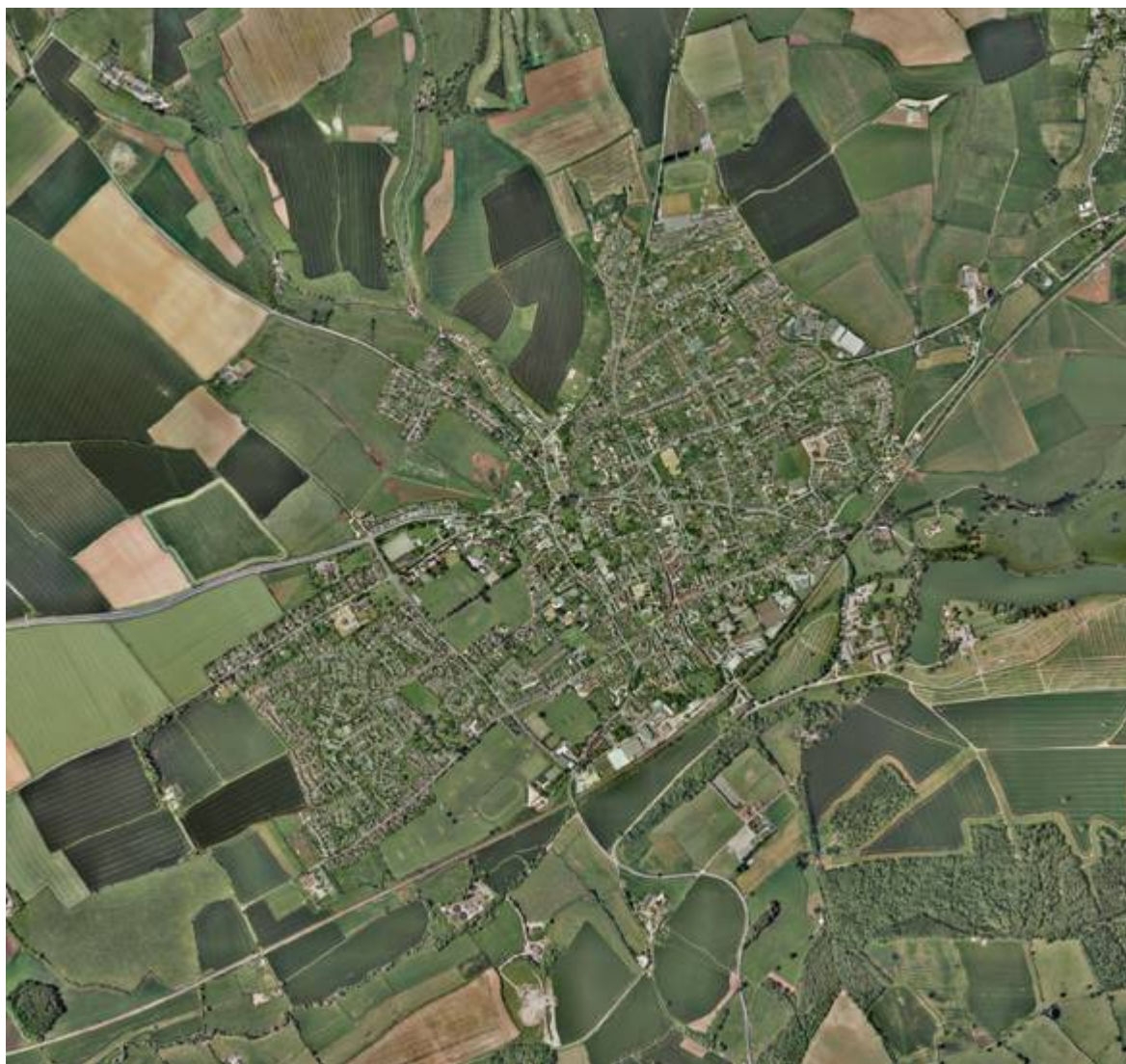
Figure 1: Vertical aerial photographic view of Sherborne, 2005.

to the character of the area to the north of The Green at Priestlands, Kings Road, Wootton Grove and Simons Road. Notable industrial buildings are the silk mills at Westbury and the Dorsetshire Brewery.