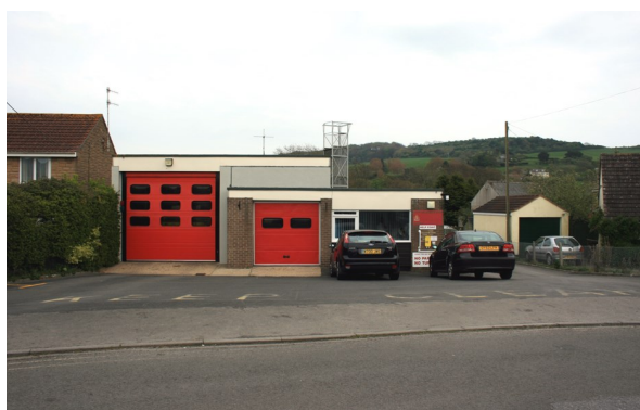
Figure 67: Charmouth Fire Station.