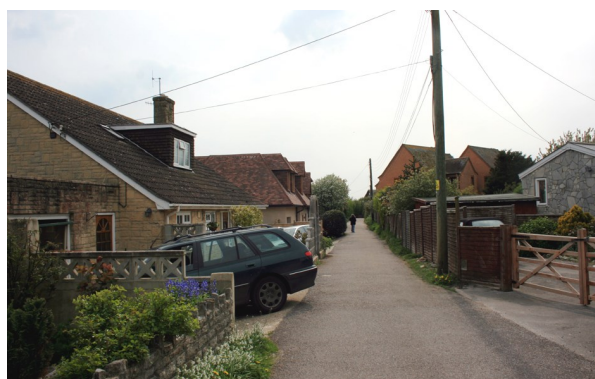
Figure 63: River Way.