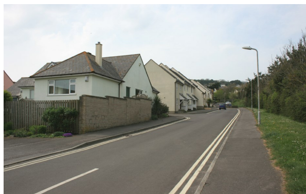
Figure 65: Hammond's Mead.