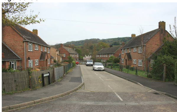
Figure 64: Post-war housing, Ellesdon, off Bridge Rd.