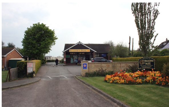
Figure 61: Seadown Caravan Park.