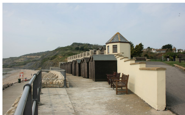
Figure 69: The Lookout on Charmouth seafront.

No Scheduled Monuments lie within this character area.