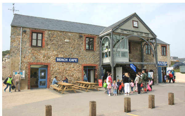
Figure 66: Former cement factory building.

character area: a honestone was found eroding out of the cliff at the west end of the sea wall (Farrar 1957, 116) and a 12 th century wooden bowl was found at the mouth of the Char (Anon 1984).