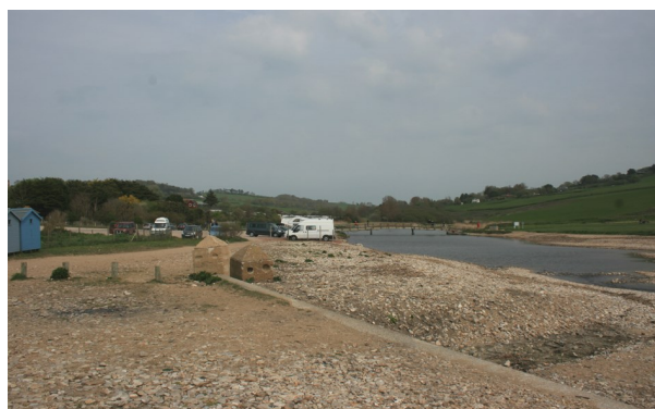
Figure 60: The Char valley looking northwards across character area.