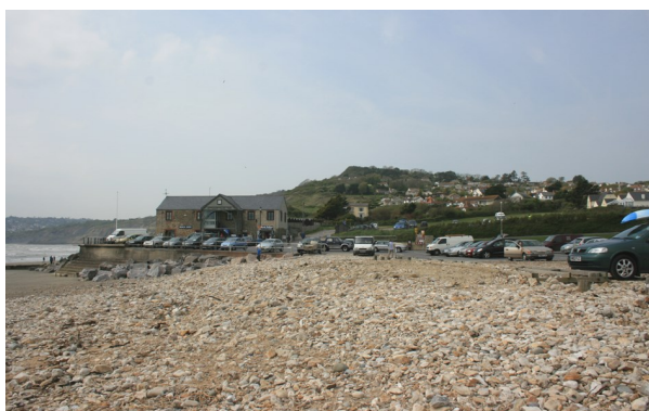
Figure 62: Charmouth Beach, looking towards Heritage Centre.

Most of the rest of the area is open, either as car parks or caravan parks. The Seadown Holiday Park is screened from the town to the west by a belt of trees and hedges.