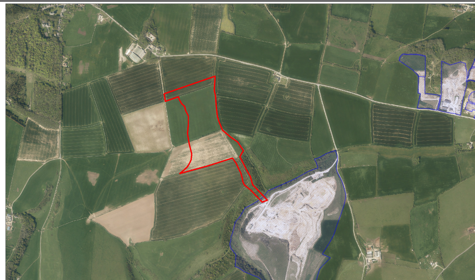
PK16 - Swanworth Quarry extension - aerial view