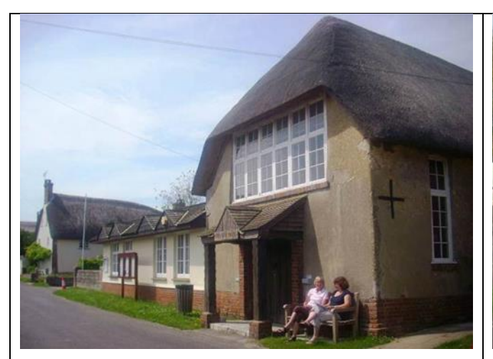
Briantspuddle Village Hall

17. While not a large extension in itself, the improvements put in place have meant that small groups have been able to meet in the more energy-efficient and cheaper Jubilee Room, while the new kitchen facilities have made catering provision easier.