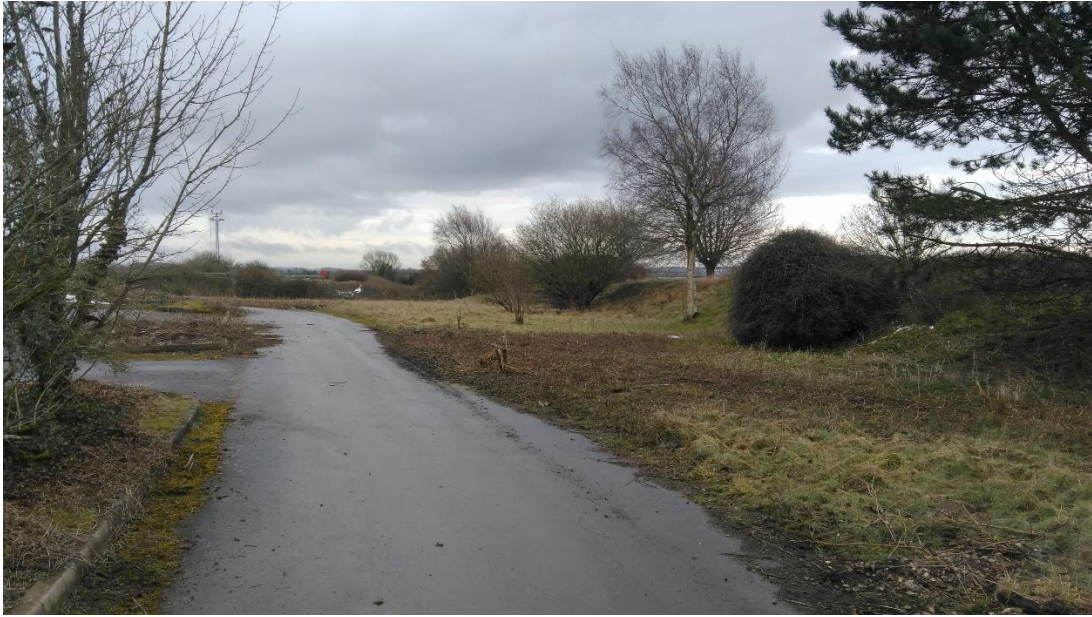
Plate 2. View looking east from the entrance into the site from Lane end. The raised bund to the right of the image forms the southern boundary of the site with the adjacent pavilion and playing fields.