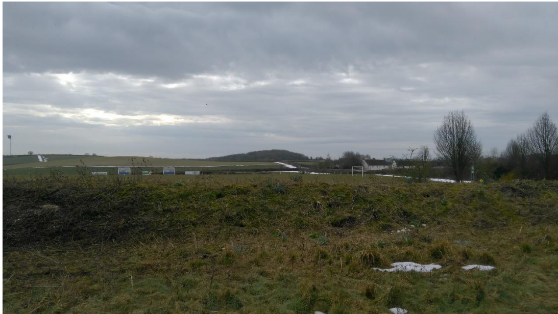
Plate 7. View from the site looking south towards Weatherby Castle, the tree covered hill within the background of the image.