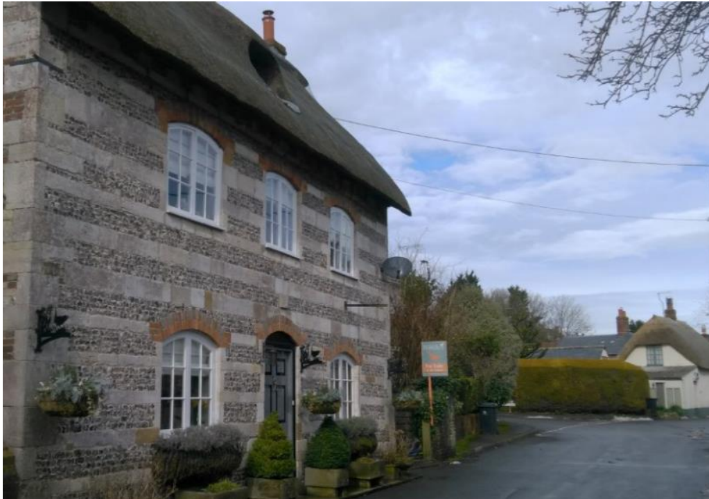
Plate 9. A combination of flint walling with natural stone banding. Stock brick lintels have been used above the windows to create visual interest. Again, the side hung casements are set within a reveal which creates shadowing, texture and interest.