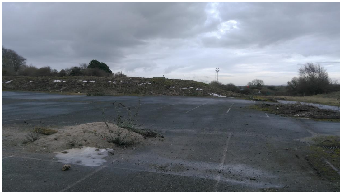
Plate 1. View within the site looking east.