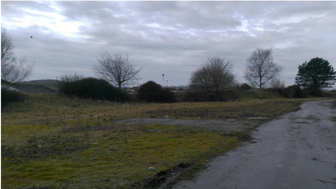
Plate 3. View from within the site looking south-west.