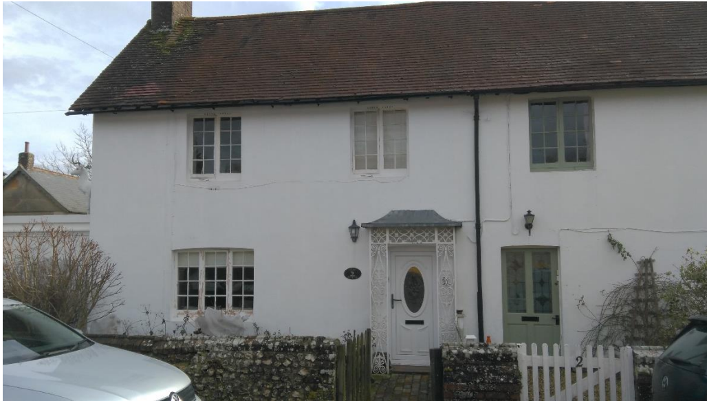
Plate 13. A 19 th Century house with painted rendered walls with plain tiled roofs.