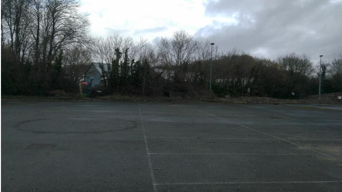
Plate 4. View from within the site looking north with the industrial site (Business Centre) beyond.