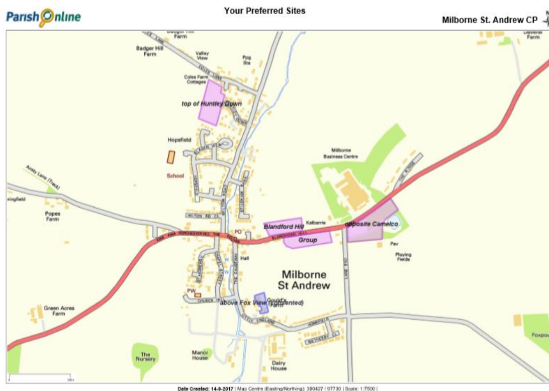
Fig. 1. The proposed site allocation is identified in purple and marked opposite Camelco above.