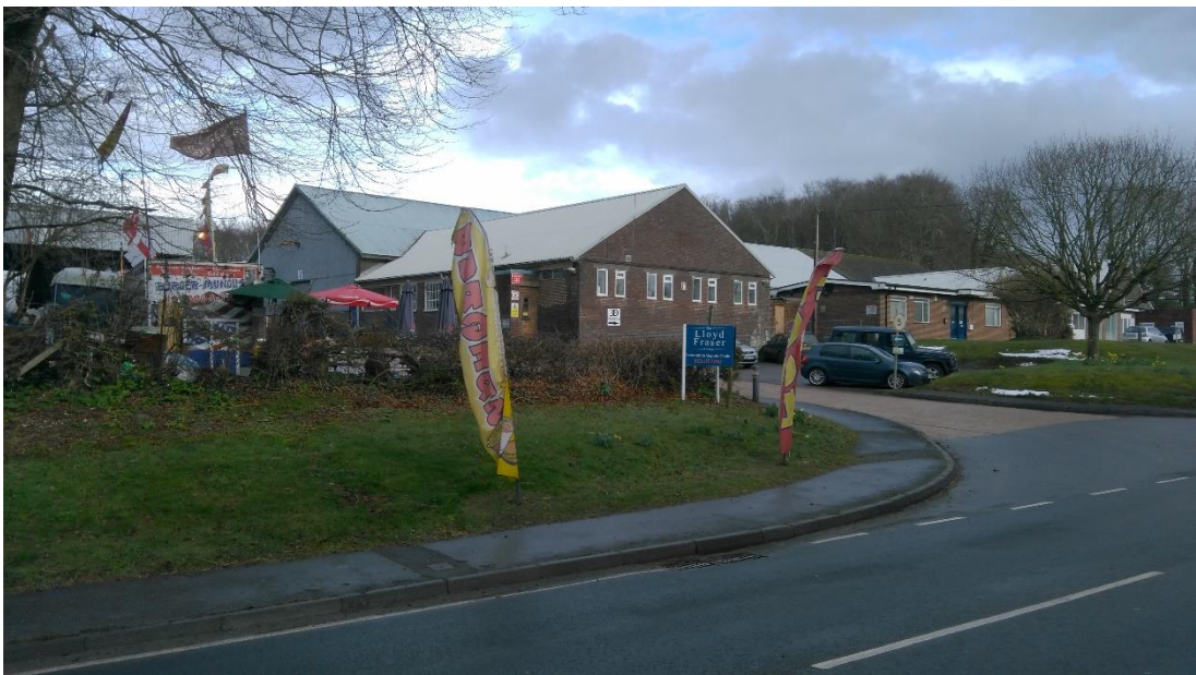
Plate 5. Milborne St. Andrew Business Centre to the north of the site allocation.