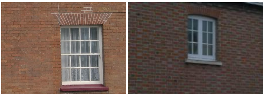
Plate 8. Typical use of stock bricks both red and vitrified blue headers which create a distinctive pattern. This image also illustrates the valued and typical vertical sliding sash and casement, both set within a reveal.