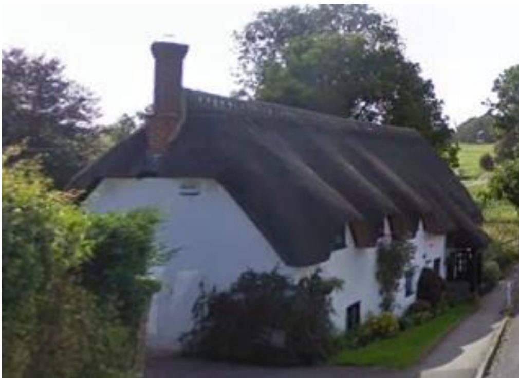
Plate 10. Little England a vernacular cottage illustrating the use of cob walling and thatch.