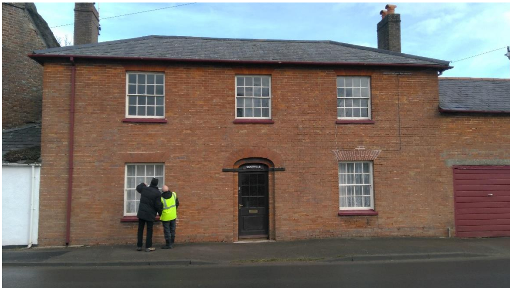
Plate 12. A 19 th Century polite villa with low pitched slate roof, symmetrically positioned windows, door and chimney stack representing the move away from the vernacular tradition