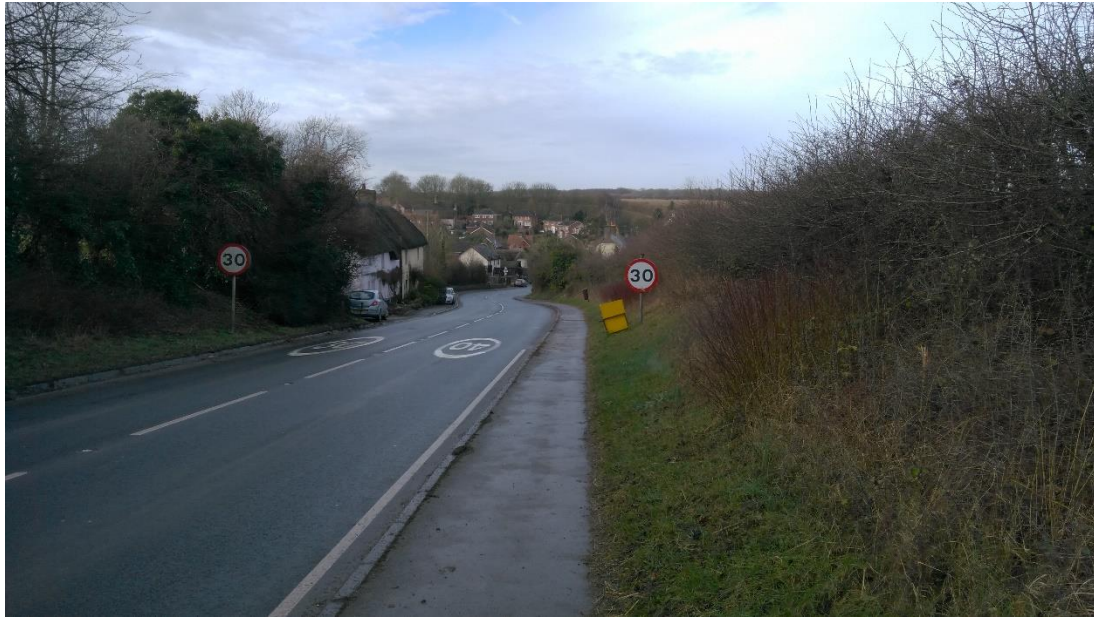
Plate 6. View looking west along Blandford Hill towards the village centre.