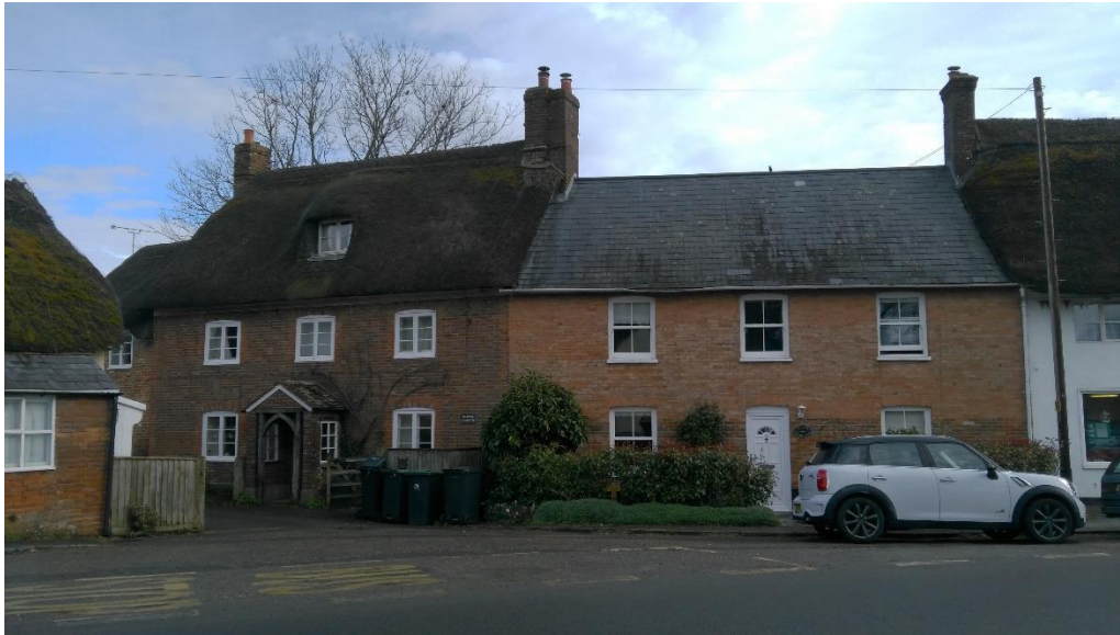
Plate 11. Good examples of a vernacular thatched building and a more gentrified or polite building to the right.