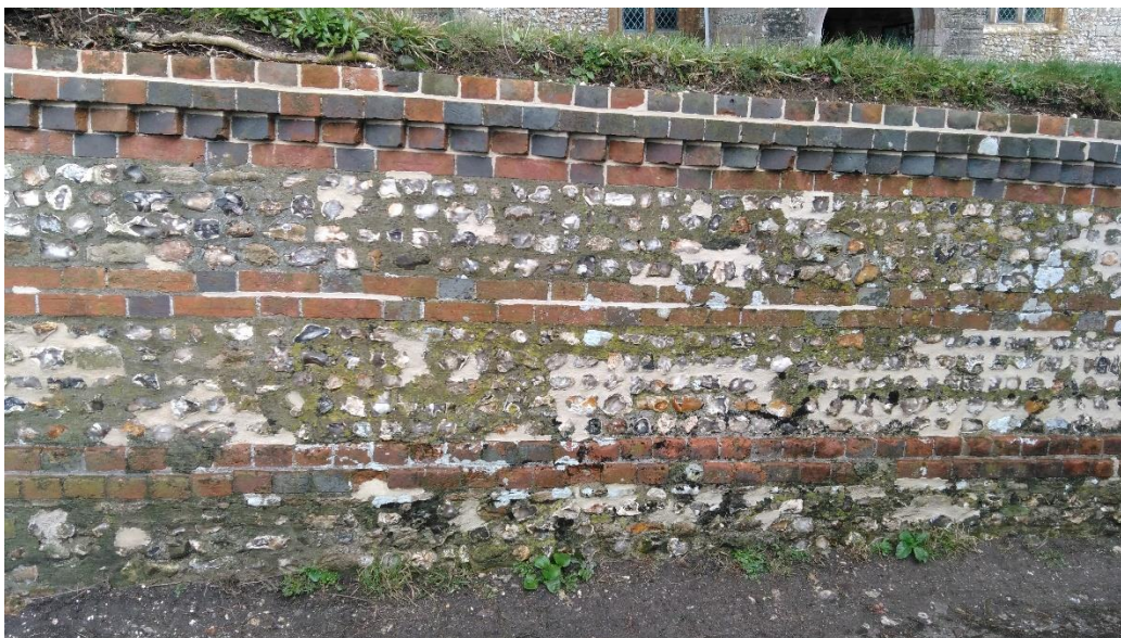
Plate 14. An attractive brick and flint wall at the Parish Church. See also Plate 13 above.

A variety of walls enclosing gardens is a strong and often repeated feature of the village which not only produces an attractive townscape but also defensible space. Walls within the village use in the main brick and flint as illustrated below: