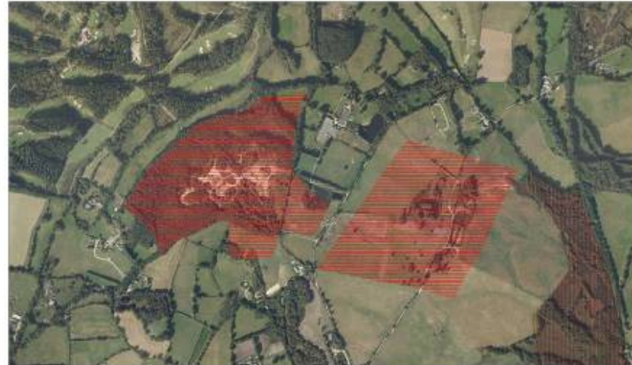
AS08 - Horton Heath Aerial View