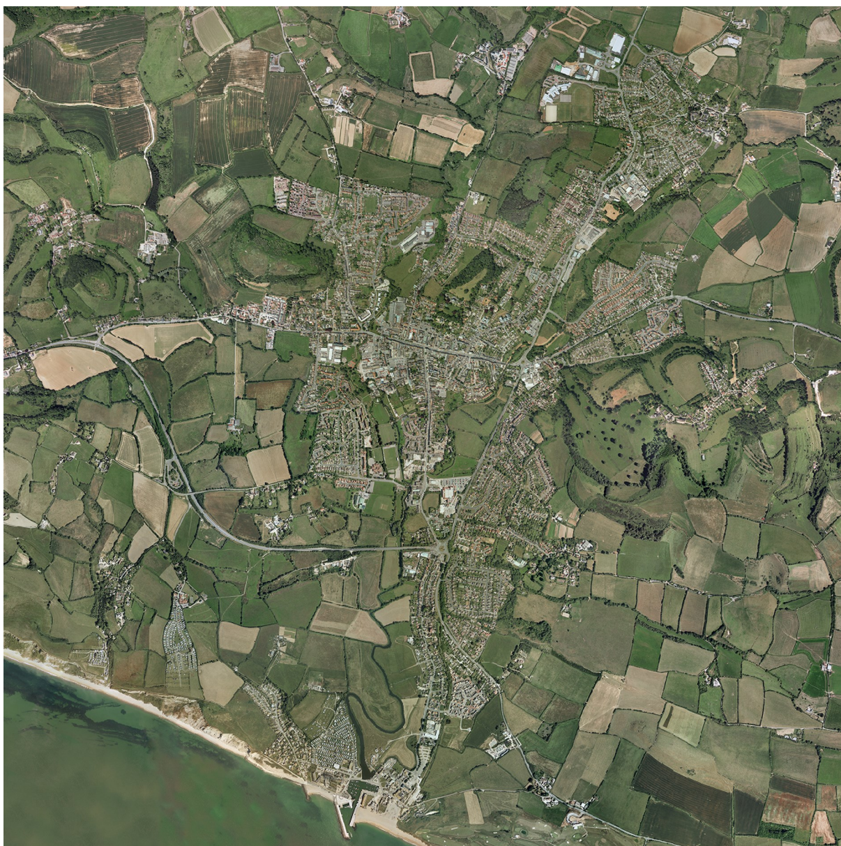
Figure 1: Vertical aerial photographic view of Bridport, 2005.

extensive survival of medieval burgh plots; the large number of historic domestic and industrial buildings; and the landscape setting. The medieval town plan survives virtually complete and exerts a strong influence, in terms of its street and burgh plot layout, affecting both the form of later historic housing and the location of rope walks and spinning ways.