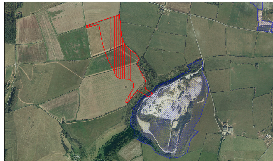
PK16 - Swanworth Quarry extension - aerial view