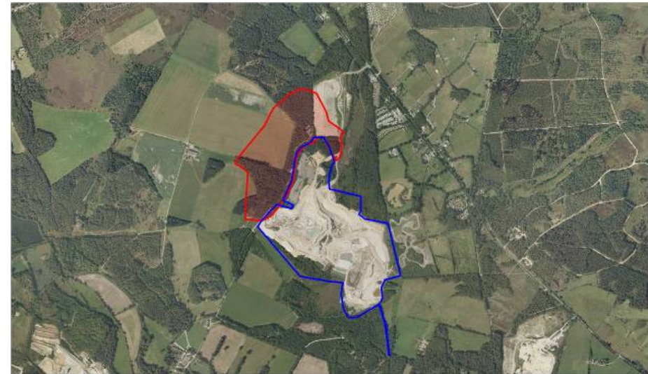
BC04 - Trigon Hill - Aerial view

Existing site with planning permission Site brought forward