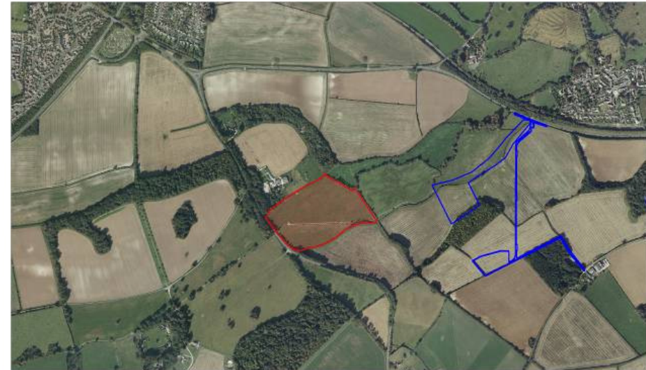
AS21 - Came Home Farm, West Stafford - Aerial view

Existing site with planning permission Site brought forward