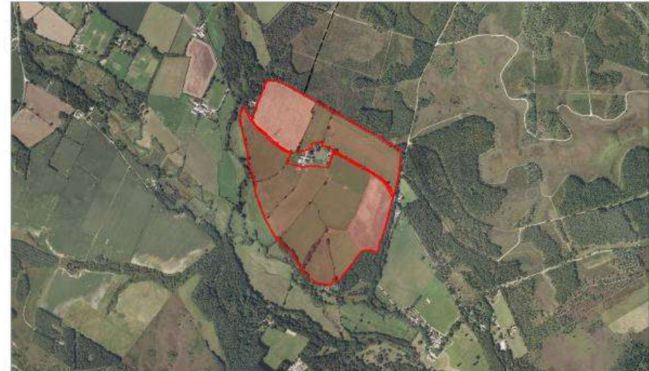
AS12 - Philliols Farm - Aerial view