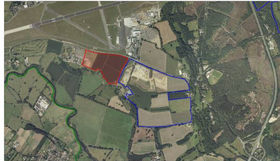
AS09 - Hurn Court Farm extension - Aerial view

Site brought forward Mineral site with planning permission