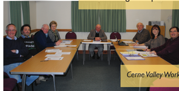
Cerne Valley Working Group