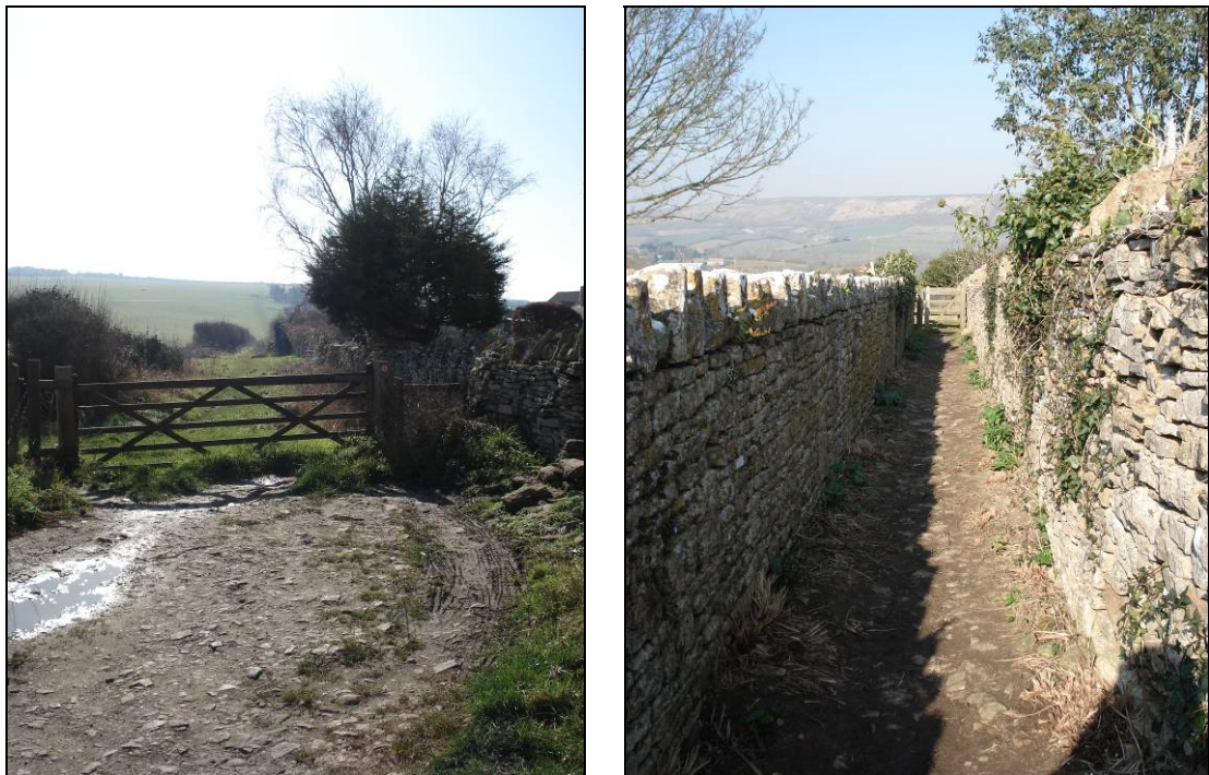
FIG. 6: Links between settlement and landscape. The linear paths and tracks leading from the settlement into the broader landscape often follow historic boundaries and routes which anchor settlement to context. Left: Garfield Lane with views across the limestone ridge. Right: cemetery walkway with views of the chalk ridge.

Within Zone 2 open space around Coombe Farm plays a crucial role in the setting of this attractive listed farm complex, providing it with landmark quality at the eastern gateway to the settlement. The rising parkland of Leeson House visible at this point to the south provides further quality to context, which combined with land around Coombe Farm helps to protect the integrity of the former hamlet from encroaching development.