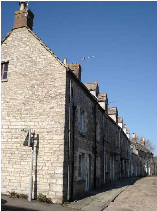
FIG. 5: North Street. A terraced development set at a right angle to the High Street, the late nineteenth century buildings here have an urban feel. Note the worn stone pavements.