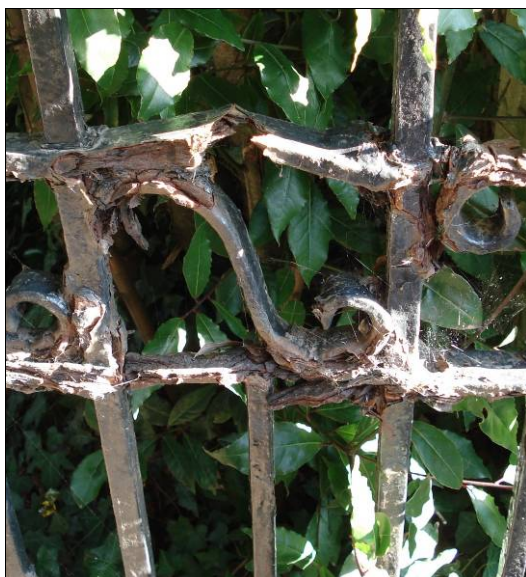
FIG. 12: Historic gates at risk. Left: those of Durnford House. Right: those of Leeson House - currently removed.

The Conservation Area contains one of the District's most threatened listed structures – the gates to Durnford House (Grade II). These are severely corroded, the wrought iron splintered and fragmenting, the damage resulting from a lack of regular repainting – a simple and inexpensive maintenance task. Major conservation works are necessary if the gates are to survive. With sufficient commitment the Local Authority could compel such work. The curtilage listed gates of Leeson House are in a similar state (see FIG. 12 below).