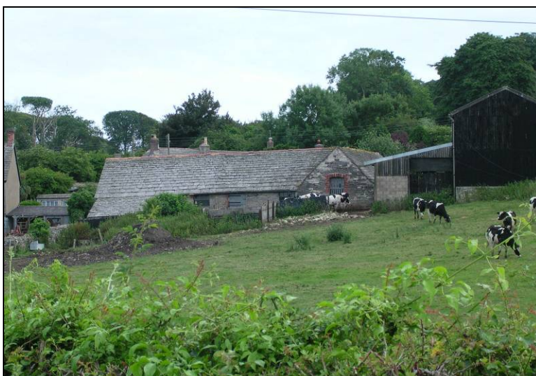
FIG. 1: Cows grazing within the curtilage of Coombe Farm. The presence of an active farm and animals within the townscape of the Conservation Area adds greatly to its character.

The broader settlement of Langton Matravers contains a range of house types and tenures, most of those within the Conservation Area historically the dwellings of quarrymen and labourers. A proportion of these small but 'quaint' properties have been purchased as second or holiday homes though a resident population exists to sustain local services and schools. While the Conservation Area is largely residential in character, notable is the continuation of agricultural activity at Coombe Farm which helps to anchor the settlement to its broader context and contribute toward a sense of vitality. The schools are also important in the latter regard and continue a strong historic tradition of the provision of educational services within the village.