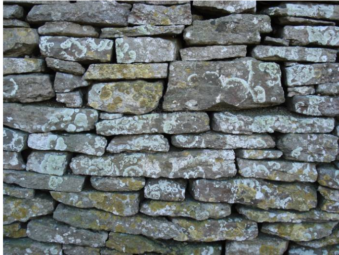
FIG.11: Lichen on stone.

It is easy to underestimate the contribution made by wildlife to the character of a Conservation Area in terms of both sights and sounds. Buildings, trees and garden spaces provide nesting, roosting and feeding opportunities for birds and bats. These together with other animal species should be accommodated and provided for within new development in accordance with PPS 9. Within Langton Matravers it is also important to note the contribution made by lichen and mosses in softening the appearance of buildings while adding colour, texture and interest.