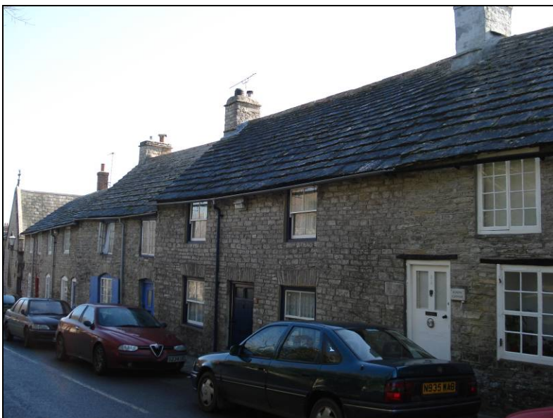
FIG. 3: Terraced estate cottages on High Street. The most densely developed part of the Conservation Area; these houses were historically associated with Durnford House and manor.

A concentrated area on the south side of the High Street in the centre of Zone 1 provides development of the greatest density. Here buildings abut, front directly onto the street and have very shallow plot depth. Similar density is only reached locally within the Conservation Area where terraced forms, such as found in North Street, are fitted into relatively small spaces. Greater spacing generally exists on the north side of High Street which contains a succession of large buildings and spacious plots located to the rear of the street frontage – the latter often providing a second tier of development within the townscape. The majority of buildings on this side of the street have some form of forecourt though in places these have been merged with the footway through removal of enclosure or setting back of replacement buildings. Within Zone 2 overall density is low, buildings forming loose groupings and standing in space, though terraced forms do act to concentrate development.