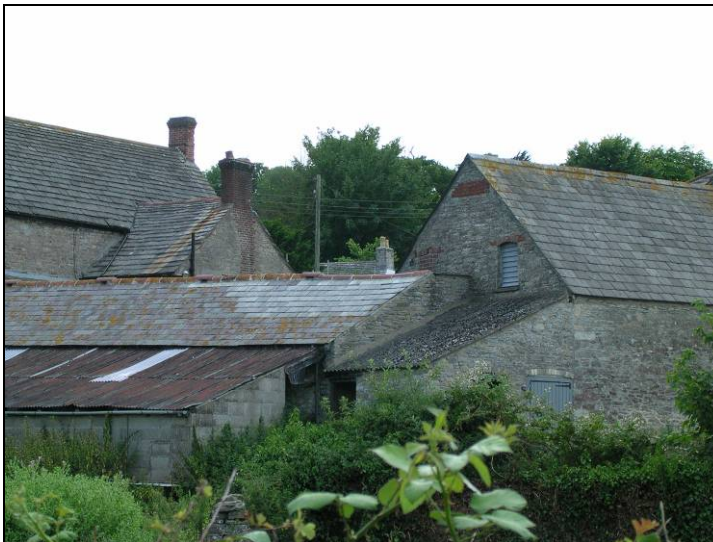
FIG. 8: Variety in roofing. The varied roof shapes, textures and coverings of Coombe Farm provide a point of visual interest. Visible are stone, slate, corrugated iron, asbestos cement and clay ridging.

Roofing: The historic vernacular within the Conservation Area employs locally sourced stone roofing tiles laid with clay ridge. These are dressed on principle dwellings, whilst cruder slabs are employed on outbuildings visible in Zone 2. In most cases roofs carry a heavy and unattractive 'pointing' applied as a weatherproofing of little technical value. Recent development has typically utilised synthetic or reconstituted stone roofing products which provide a poor match to traditional tiles and may be seen to undermine the character and heritage of the settlement. The front elevation of the recent extension of the Rectory nursing home represents a notable exception unfortunately not continued to the rear. Slate is otherwise present on a number of mid-late nineteenth century properties, while a range of functional sheet coverings are characteristic features of agricultural buildings. Roofs are typically pitched, half hipped and fully hipped forms are an infrequent feature most often associated with intrusive forms of development.