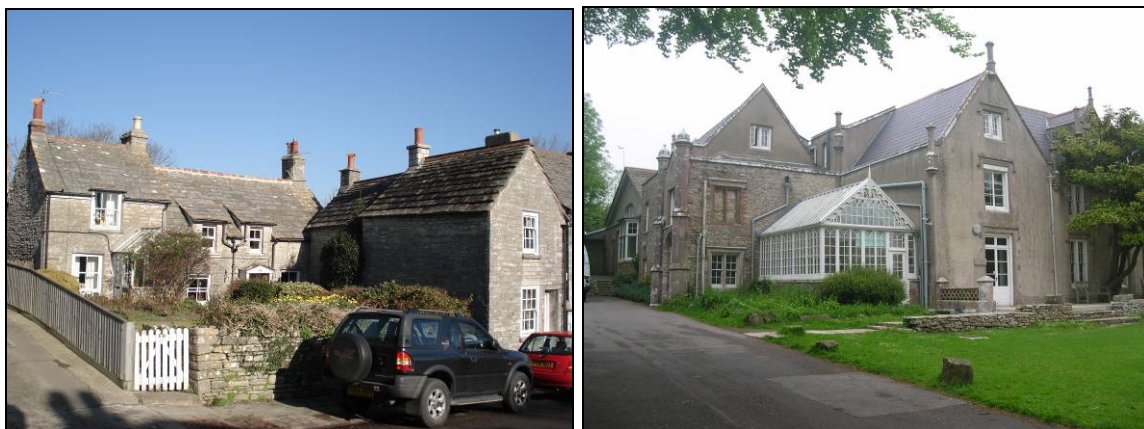
FIG. 7: The vernacular and polite. Left: 34 High Street, a courtyard development displaying various characteristics of the local vernacular. Right: Leeson House in Gothic Revival.

The Conservation Area contains a range of vernacular structures and more formal pattern book designs constructed using a palette of local materials. Typical of the former are the area's smaller cottages which often exhibit an irregularity and inconsistency in terms of proportion and the arrangement of architectural elements. Typical of the latter are various late nineteenth century buildings readily identifiable through their generally larger proportions and strong vertical emphasis. Ornamentation is generally lacking though the Gothic Revival of Leeson House (see FIG. 7) and Regency style of Two Leas House represent notable exceptions related to their status. Twentieth century suburban style development has infiltrated the area in a number of locations and often stands out due to the conventions in composition and layout that it adopts.