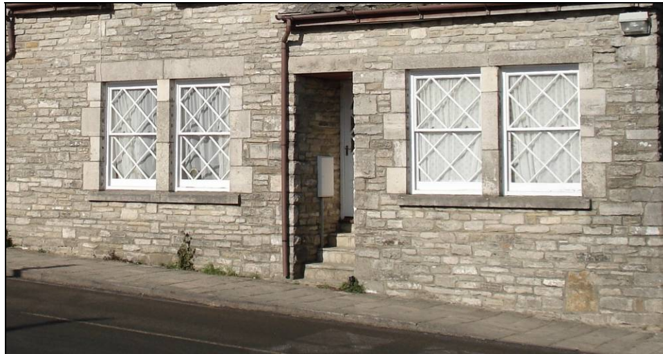
FIG. 9: Lattice glazing bars. Windows with lattice glazing bars are encountered frequently within the Conservation Area.

Windows: The Conservation Area shows a generally good rate of survival for historic windows, this to some extent a product of the number of listed buildings it contains. A range of window types may be identified, these including vertically sliding sash, horizontally sliding sash (or 'Yorkshire sash'), casement and windows which have a central pivot – the latter perhaps the product of a particular local joiner. Also of note is the occurrence of both sash and casements with a lattice configuration of glazing bars (for example the Malt House School, Little Durnford, Coombe Farm amongst others). Flat stone sills and lintels are common, though arches are formed above some windows using slips of stone set on edge. In a few instances ashlar blocks are used to define the reveals of windows where rubble stone would provide a poor edge. Generally speaking the proportions of window openings in historic properties have either a moderate or stressed vertical emphasis contrasting with the strong horizontal emphasis viewed on many more recent houses.