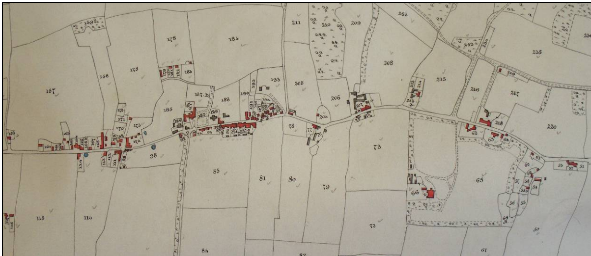
FIG. 2: Parish of Langton Matravers tithe map 1841. At this time there were three distinct clusters of development with scattered buildings between. (DRO T/LAM)

The 1860s saw application by Wareham Trust to abandon the Kingston-Swanage Road in favour of a new route between Corfe and Langton via Harman's Cross. While closure did not take place the new road, in part formalising pre-existing tracks, was constructed and entered Langton along Crack Lane. The mid-late nineteenth century otherwise saw development of increasingly urban character, vernacular styles displaced by standard pattern book forms albeit in local materials. These tend to form isolated developments, and the contemporary tithe map (see FIG. 2) still shows settlement relatively broken east and west of the High Street. To the west of the centre a series of terraces were constructed running at right angles to the street for reasons not entirely clear. The pattern is continued to the west and south west of the village at East and West Acton Field and at Blacklands. The most notable example is the North Street development (see FIG. 5).