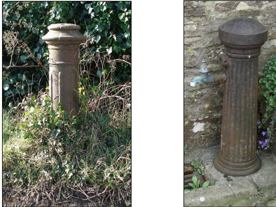
FIG. 10: Streetscape features. Left: stump of a sewer vent pipe in Garfield Lane; Right: cast iron standpipe on High Street.

Unlisted buildings which make a 'positive' contribution to the character and appearance of the Conservation Area are detailed on Map 3 together with those deemed to have both a 'neutral' and 'negative' impact. Examples are provided below: