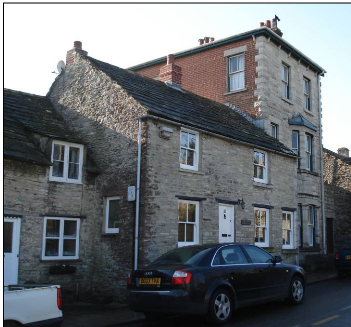
FIG 4: Contrasts in height. Here viewed from one and a half to three storeys between 35 and 39 High Street. Note the Swanage brick flank wall of No.39.

Most development within the Conservation Area stands at two storeys, though variation occurs within this category with differences in architectural proportion and changes in ground level – resolved by stepping along High Street. A few very diminutive historic one and one and a half storey properties provide interesting texture, though sprawling modern bungalows represent an intrusive feature. The three storey heights of broadly contemporary 39 and 107 High Street are exceptional, the latter providing an interesting punctuation, though appearing somewhat out of place. The grouping of Nos. 35, 37 and 39 High Street perhaps illustrate best the influence of all the above factors in providing variation (see FIG.4).