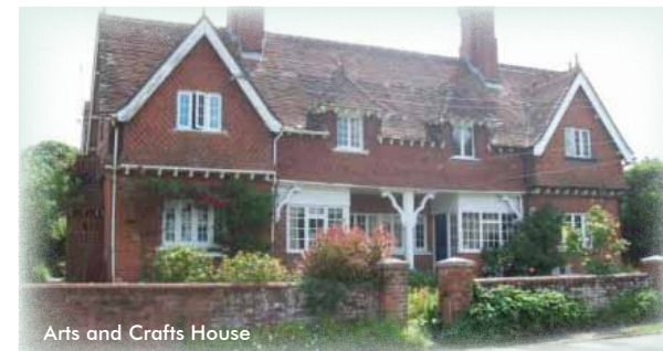
Arts and Crafts House