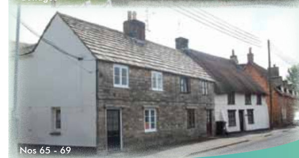
Nos 65 - 69

Planning Services, Purbeck District Council, Westport House, Worgret Road, Wareham, Dorset, BH20 4PP. Tel: 01929 556561. Web: www.dorsetforyou.com/purbeck Published: May 2012