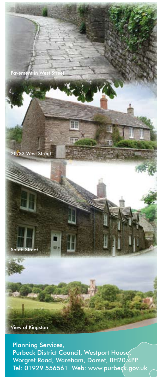
Pavement in West Street

The Character Appraisal document is available for reference at Corfe Library, the District Council offices and may be downloaded from our website: www.purbeck.gov.uk