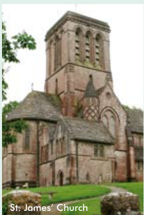
St. James' Church

Kingston is of interest as an example of a small estate village, the extent and layout of which has remained relatively unchanged since the late nineteenth century. The activities here of the philanthropically inclined William Morton Pitt – pioneer, amongst other things, of the