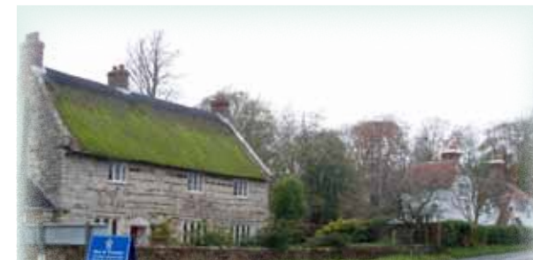
Cottages at East Lulworth