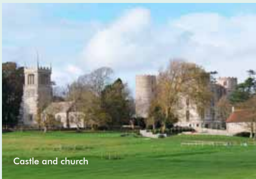
Castle and church

East Lulworth Conservation Area was first designated during 1977, and was reviewed in 2015. A character appraisal has been adopted.