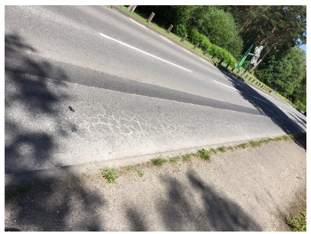
Further statement from St Leonards & St Ives Parish Council ID : 814793