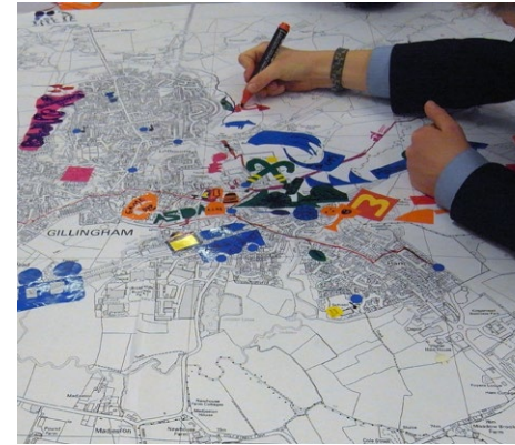
This page: Various young people's workshop session results

The following pages summarise key outcomes from the workshops.