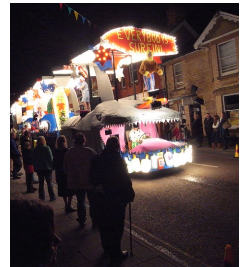
This page: Gillingham Carnival, October 2012