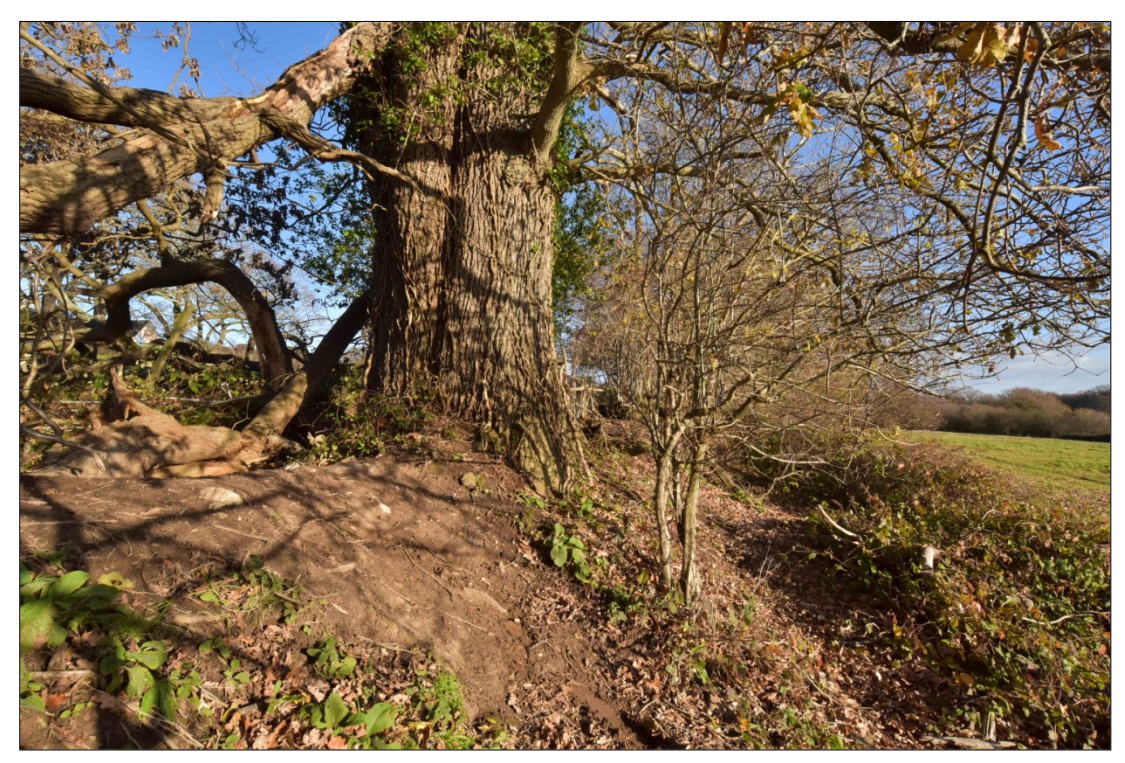
FIG 7. Hedgerow between Fields E & F, very large Oak on the hedgebank.