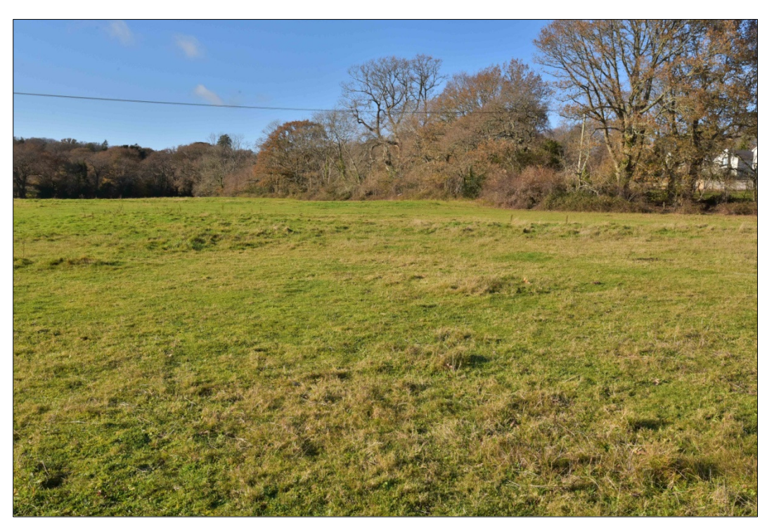
FIG 4. Field E, eastern side, looking west – northwest.