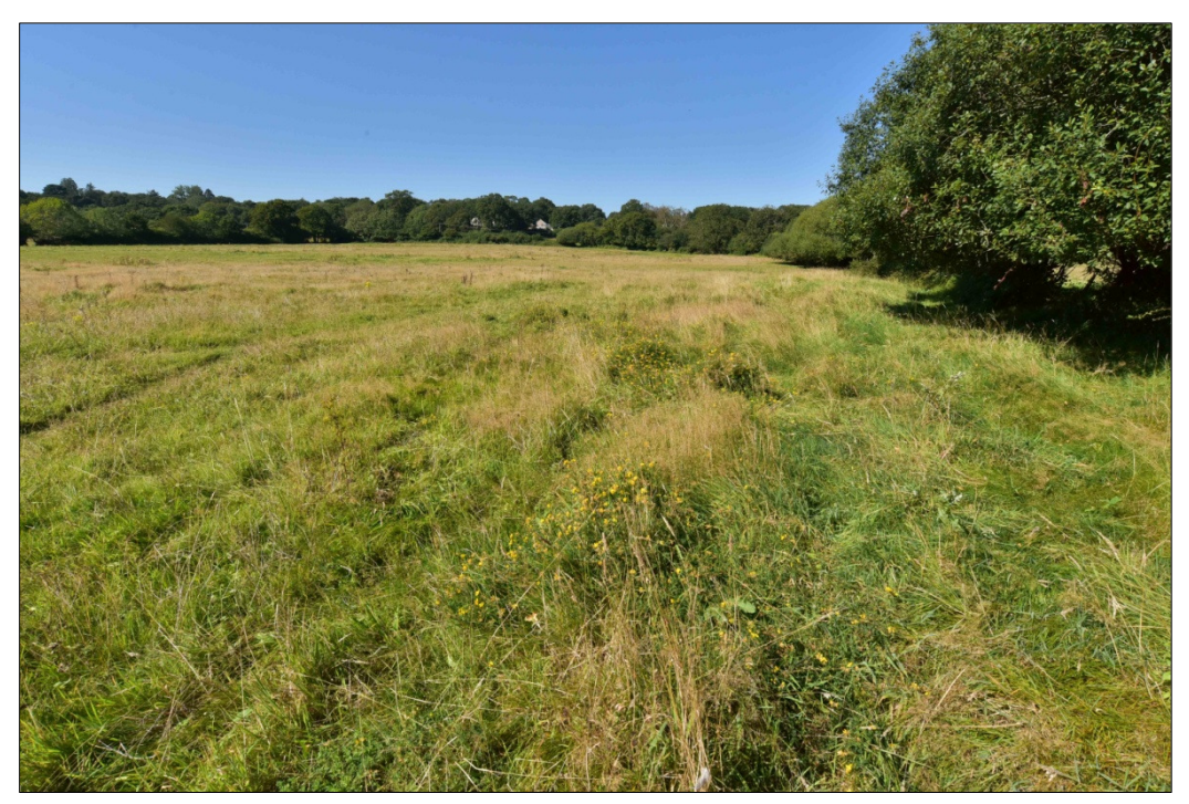
FIG 3. Field C, southeast corner, looking north.