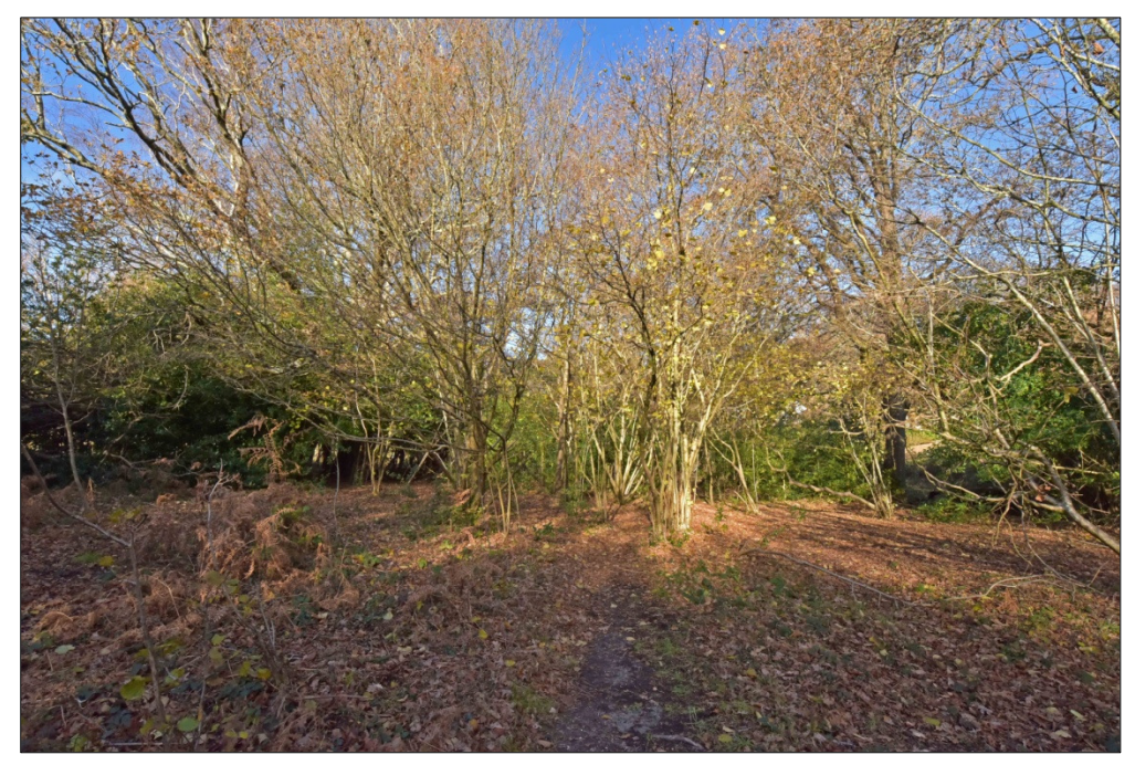
FIG 5. Woodland area, northern part with Hazel and Holly and sparse field layer of Bracken and Bramble