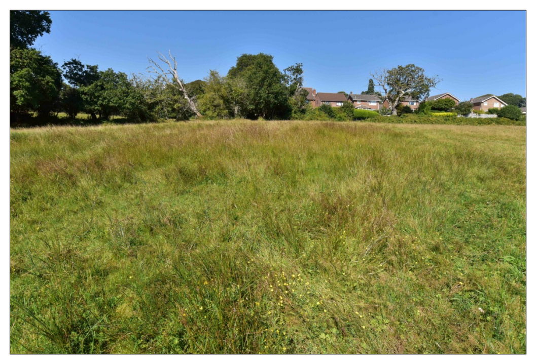
FIG 2. Field A, Spring in northwest of field with abundant Sharp-flowered Rush and Lesser Spearwort.