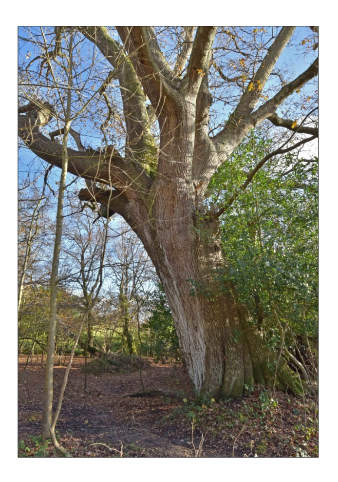
FIG 6. Woodland area, very large Oak on edge of the wood in the northwest corner. The pale streaks on the left-hand side of the lower trunk is the notable lichen Inoderma subabietinum .