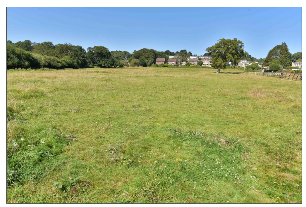
FIG\ 1.\ Field\ A , southern part looking north, grassland typical of the site with shorter, hard grazed patches and some areas with longer vegetation.