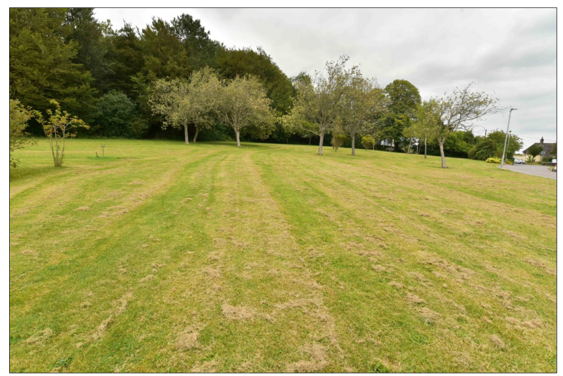
FIG 3. Grassland in front of the buildings which has a slightly more diverse flora including frequent Autumn Hawkbit and Lesser Hawkbit and occasional Hedge Bedstraw, with the Dorset Notable Mouse-ear Hawkweed noted in one area near the entrance.