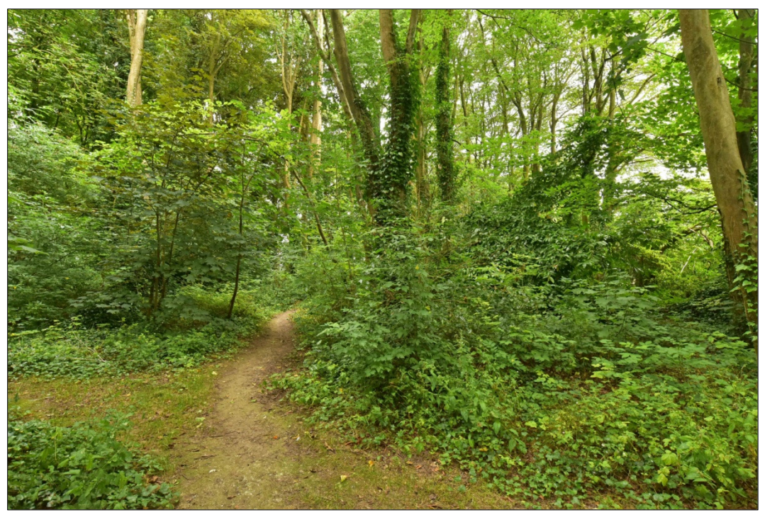
FIG 4. Mature broadleaved plantation woodland in the northeast of the site dominated by Beech and Sycamore with a sparse understorey. Although supporting no notable plant species the woodland does provide habitat for breeding birds and foraging bats.

Dorset Environmental Records Centre Ecological Survey Local Plan Site: Forston [DOR15] November 2021